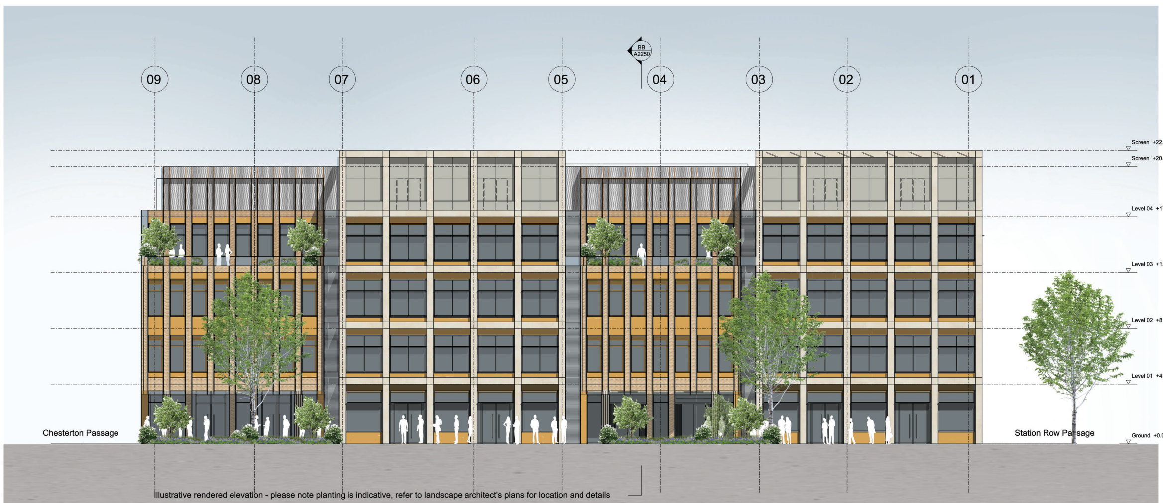
Illustrative rendered elevation - please note planting is indicative, refer to landscape architect's plans for location and details

Project No. 1818 Draw No. PA2200 Rev No. 00