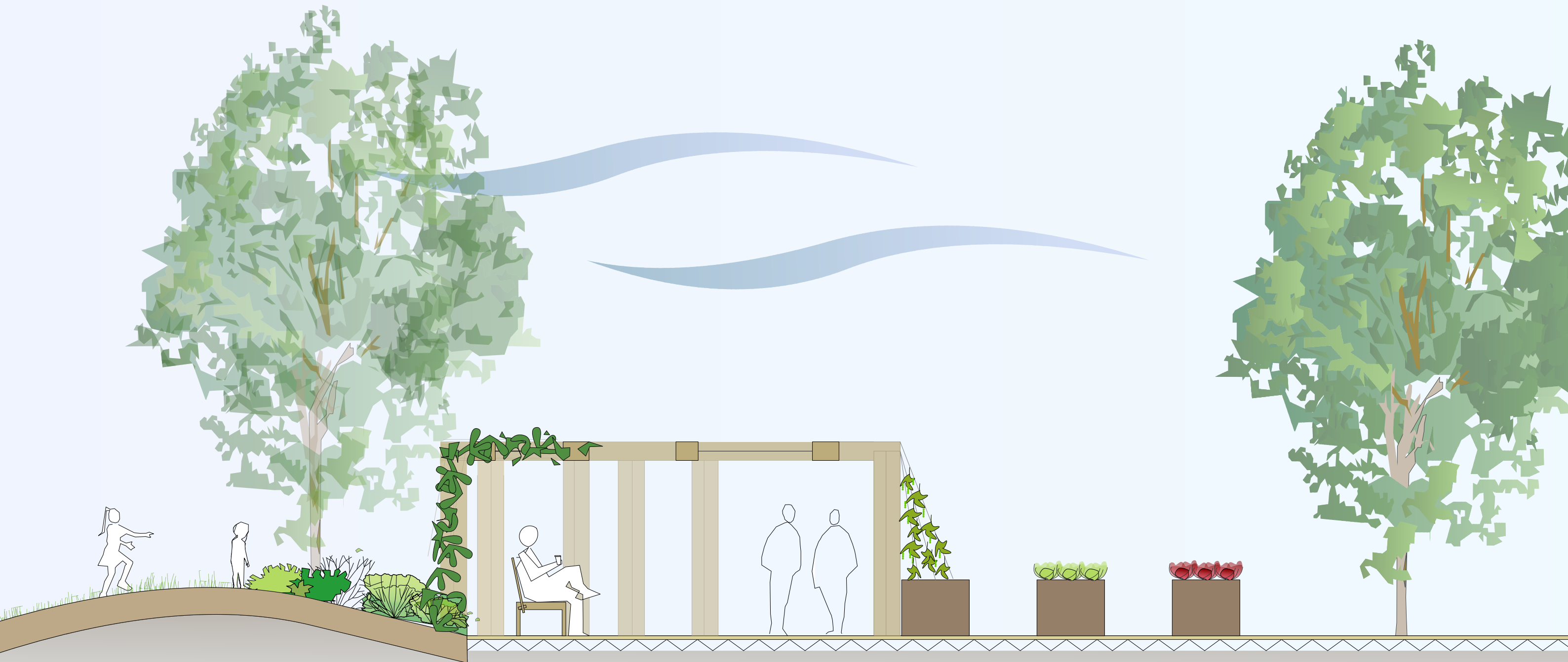
S-1 Chesterton Gardens: Pergola - Section Scale 1:50@ A3