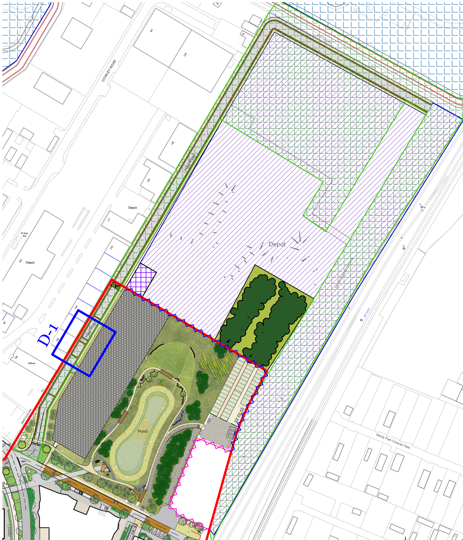
P-1 Wild Park, Haul Road and Aggregates Yard Scale 1:2000 @ A3

13-15 Covent Garden Cambridge CB1 2HS Tel: +44 (0) 1223 351400 info@robertmyers-associates.co.uk www.robertmyers-associates.co.uk