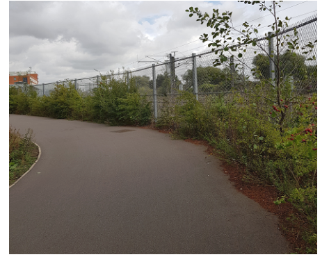
Precedent image: National Rail approved fencing

DO NOT SCALE FROM THIS DRAWING TO BE READ IN COLOUR Contractors, sub-contractors and suppliers are to verify any critical dimensions on site prior to commencing work, fabrication or construction of any elements. Any discrepancies or errors must be brought to the attention of Robert Myers Associates. All structural elements are shown indicatively. For all elements of structure, refer to structural engineers' and specialist sub-contractor/fabricators' design, detail and specification. The drawings are to be read in conjunction with all relevant landscape architect, consultant and specialist drawings. This drawing is to be read specifically in conjunction with: 630_01(MP)006 Hard Landscape Strategy (Wild park).