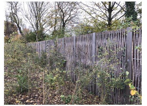
Precedent image of Fencing interface: woven willow acoustic fencing at Cambridge North Station