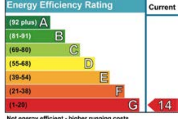
Not energy efficient - higher running costs

Sustainable Warmth is administered by Local Authorities who have been successful in applying