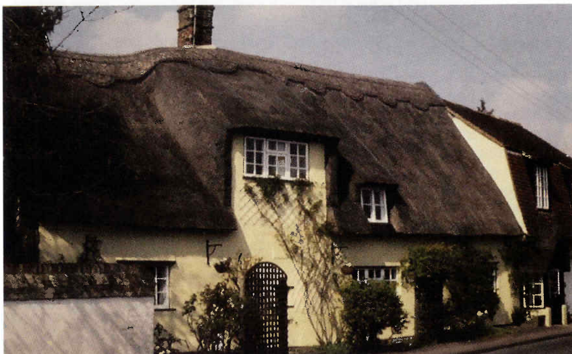
Honeysuckle Cottage, Balsham Road

war memorial green, surrounded by fine trees, all neatly cared for. As many as fifty-six properties in Fulbourn are listed as Grade II buildings of architectural or historic importance. St Vigor's Church and the 14 th -century Highfield Farmhouse have the special grading of II*.