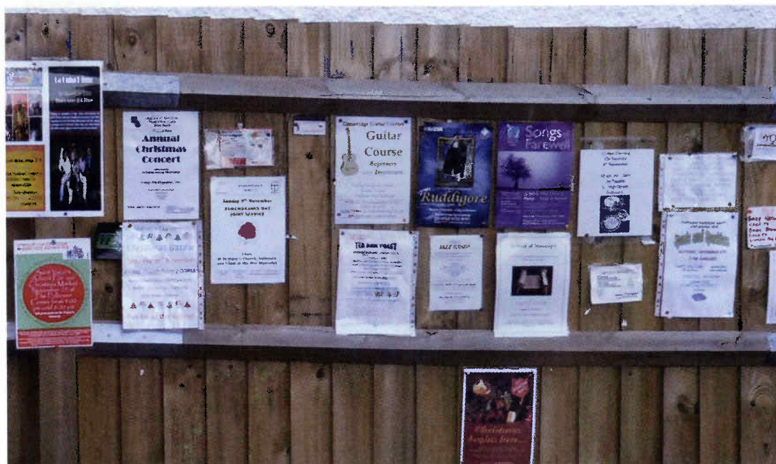
Communication in action

Other than The Mill , the most effective form of communication in Fulbourn is through the posters on this fence. They seem to be looked at more often than 'official' notice-boards in the High Street opposite, by the Post-Office or outside the Church, where the notices are less varied and less lively. The fence is beside the Co-op, to whom it belongs, and they are happy to see it used in this way.