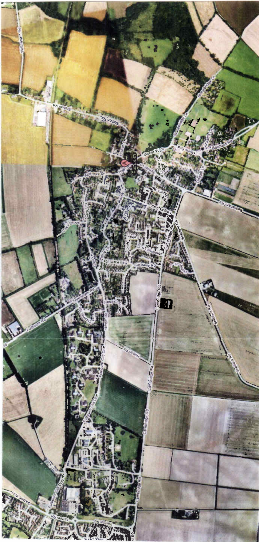
Aerial map of Fulbourn