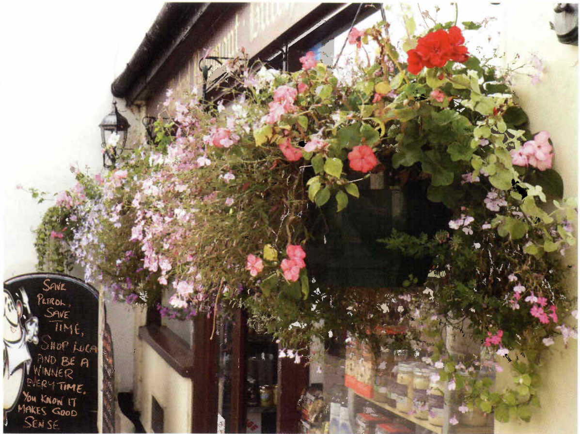
The butcher's shop in Fulbourn High Street.

To encourage other shops, perhaps the Parish Council would make a grant for Fulbourn to become a village fleuri , with hanging baskets attached to lamp-posts (not forgetting that they will need regular watering ...by somebody).