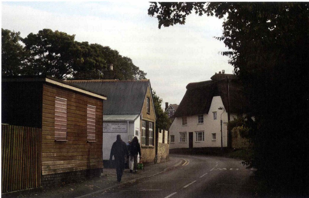
Pierce Lane, looking towards the High Street

The establishment on the left is Parker's joinery works. At the end of the narrow roadway round this curve, a sharp turn to the right is required to get into the High Street.