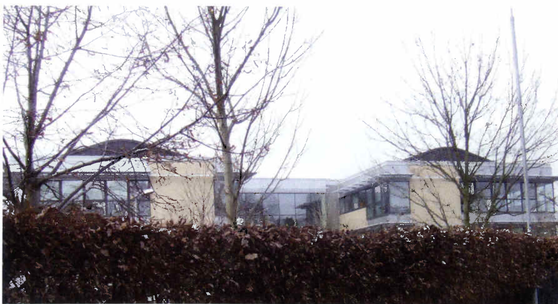
Part of the recently developed Capital Park, screened by mature trees and hedges

A group, based on the membership of the Business and Employment Working Party, to be set up to ascertain the need for a Fulbourn Business Register, and to seek Parish Council support in achieving this through Internet and other means of communication; and thereafter making it available for reference, e.g. in the village Library.