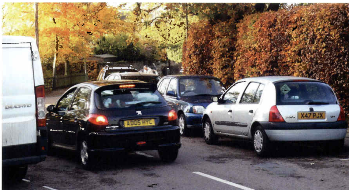
Fulbourn High Street, week-end shopping

Among many complaints (and almost as many ideas for their solutions) one respondent simply said that 'traffic in the High Street is difficult with all the parking.' Two photographs illustrate this.