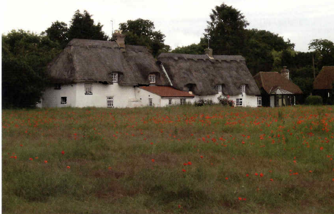
Thatched cottages along Stonebridge Lane

Dating cottages is often difficult, but these were probably built about 1700. The field, part of the Green Belt in the Local Development Plan, is another example of the wider landscape beyond extending between houses, in this case between those on Stonebridge Lane and Balsham Road. It forms a lung of land, up to the eastern boundary of the village recreation grounds.