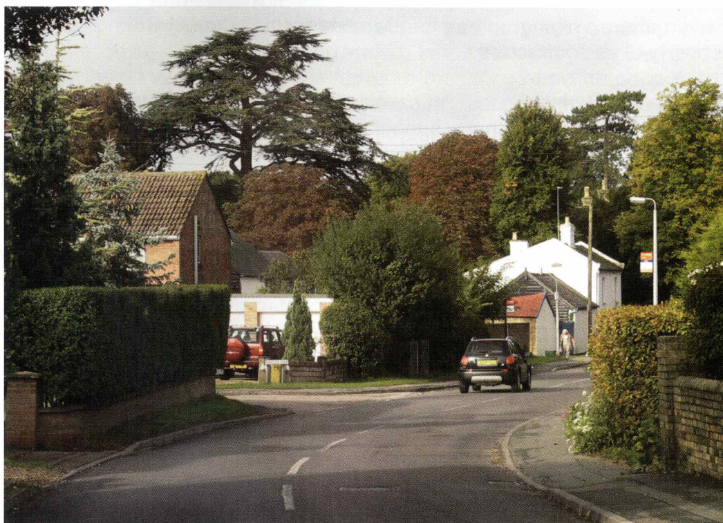
Pierce Lane, looking away from the High Street

The establishment on the left is Parker's joinery works. At the end of the narrow roadway round this curve, a sharp turn to the right is required to get into the High Street.