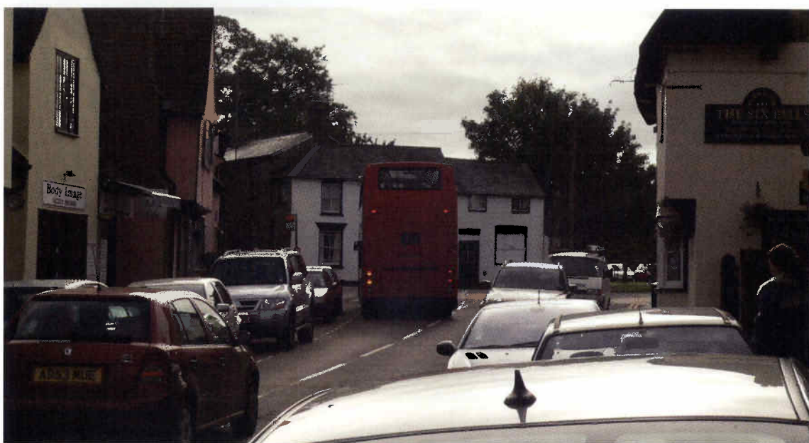
The High Street on a quiet Monday mid-morning

With vehicles parked on both sides of the road, a car brakes suddenly as a lorry is about to emerge from the Pierce Lane junction on the left.