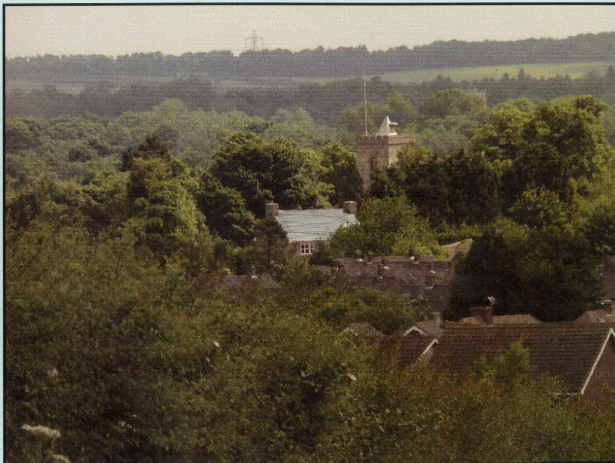
Fulbourn from the Shelford Road