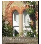
ARCHED WINDOW DETAIL