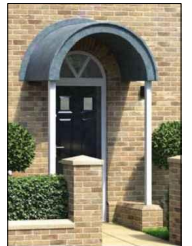
DOOR CANOPY STYLE