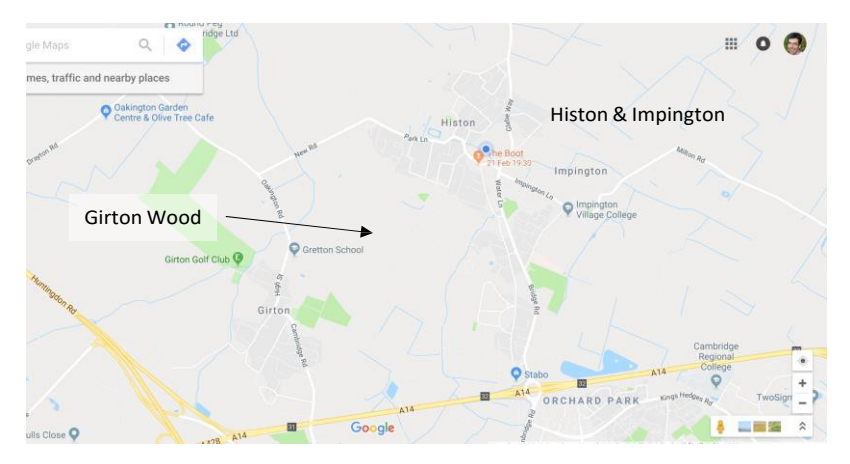
Figure 1. Location of Girton Wood, to the South West of Histon and Impington