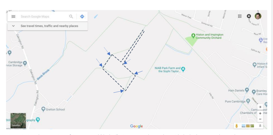
Figure 3. Google maps view of Girton Wood (dashed). Girton Wood, together with the hedgerow to the north east, is 2.8 hectares. The arrows show the five entry points to the wood. The northern boundary is approximately 180m south-southwest of St Audrey's Close.