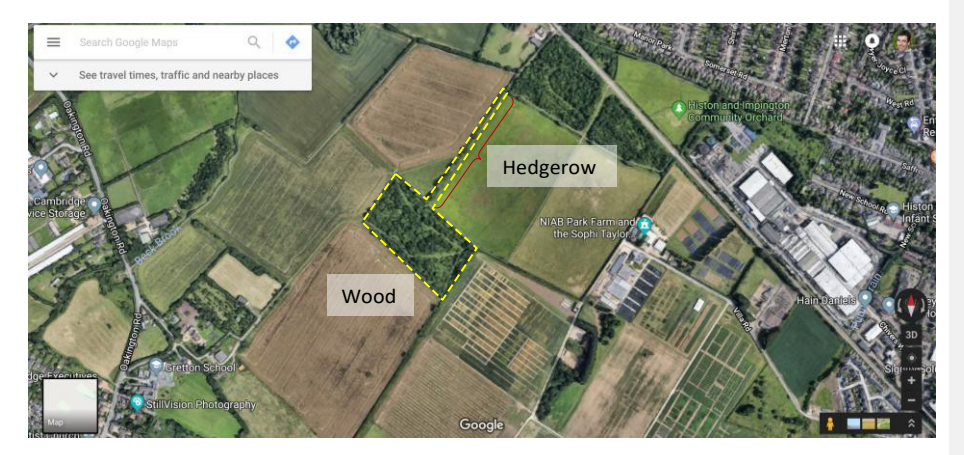
Figure 2. Google maps satellite view showing Girton Wood together with the hedgerow (including ditch and adjacent scrub) running to the north east from the Wood.