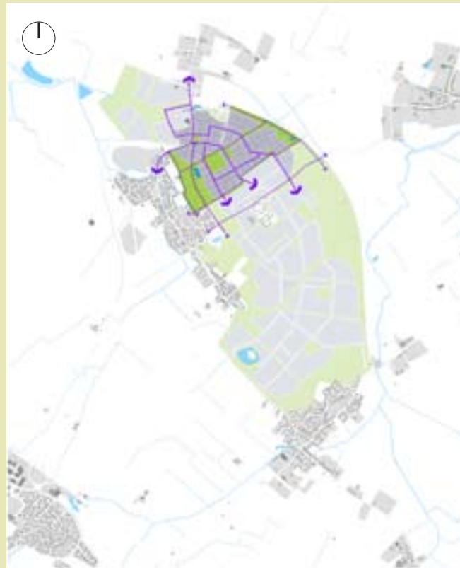
Street network and non-vehicular connections

The following series of thematic diagrams illustrate how the Phase 1 master plan can expand in the future to become a coherent and legible new town.