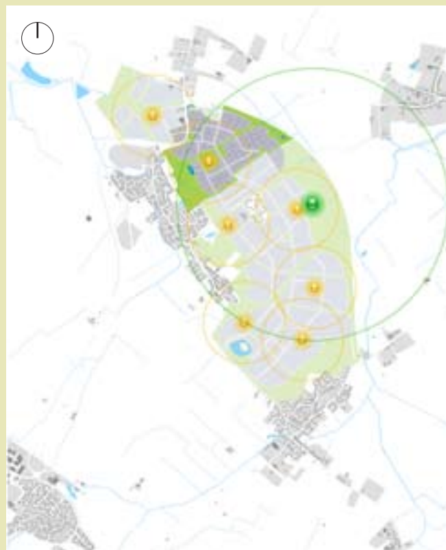
Primary and secondary schools