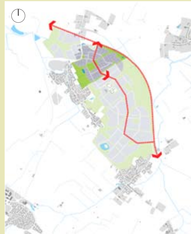
Cambridgeshire Guided Busway and associated dedicated busway route