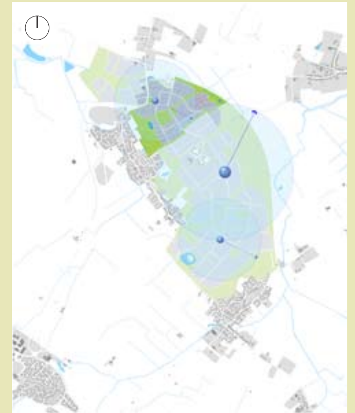
Centres and employment zones