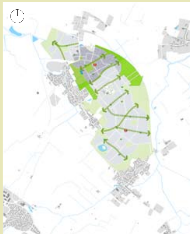
Landscape structure and open space