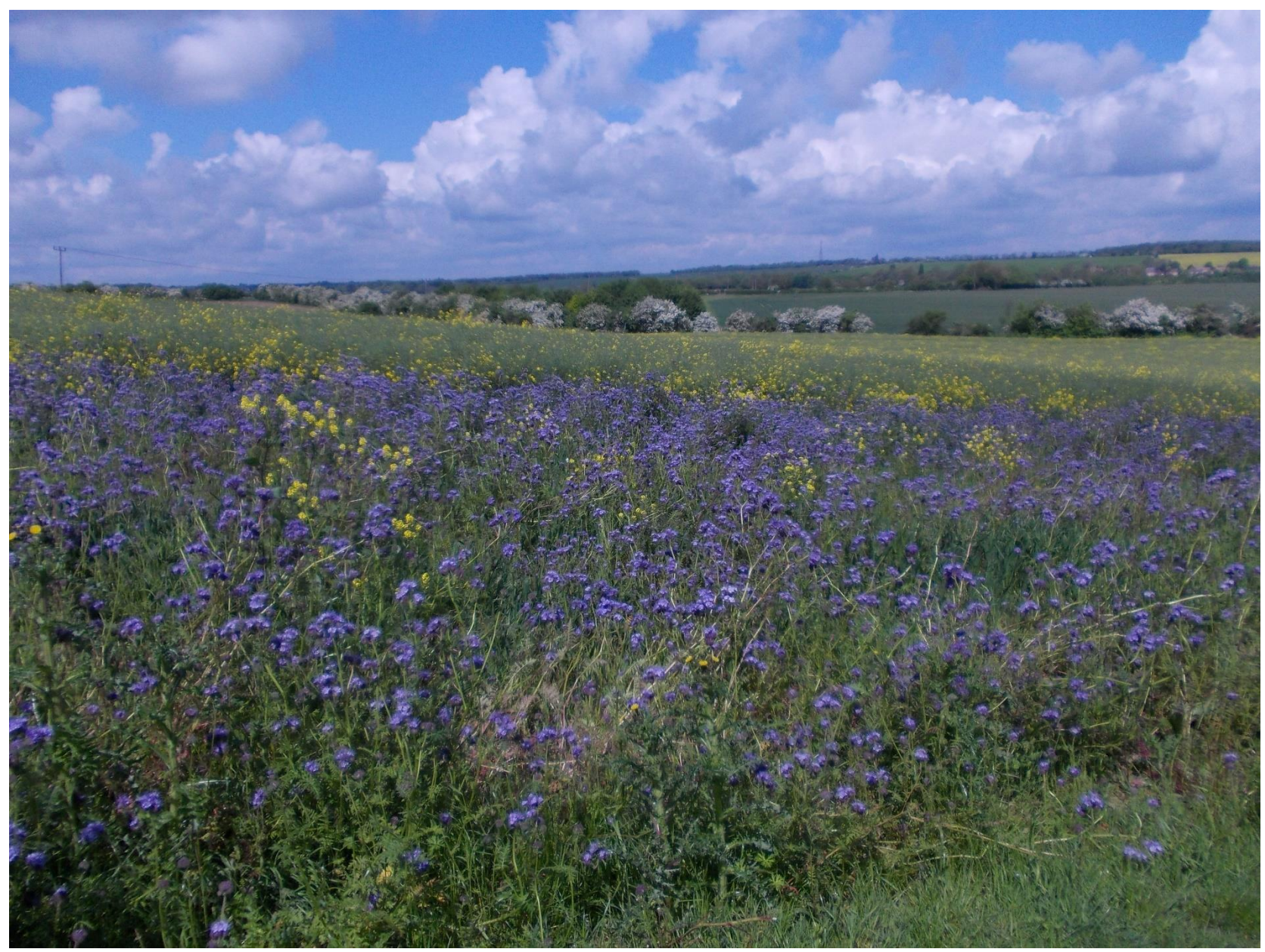
Coton Margin (edge of Cambridge)