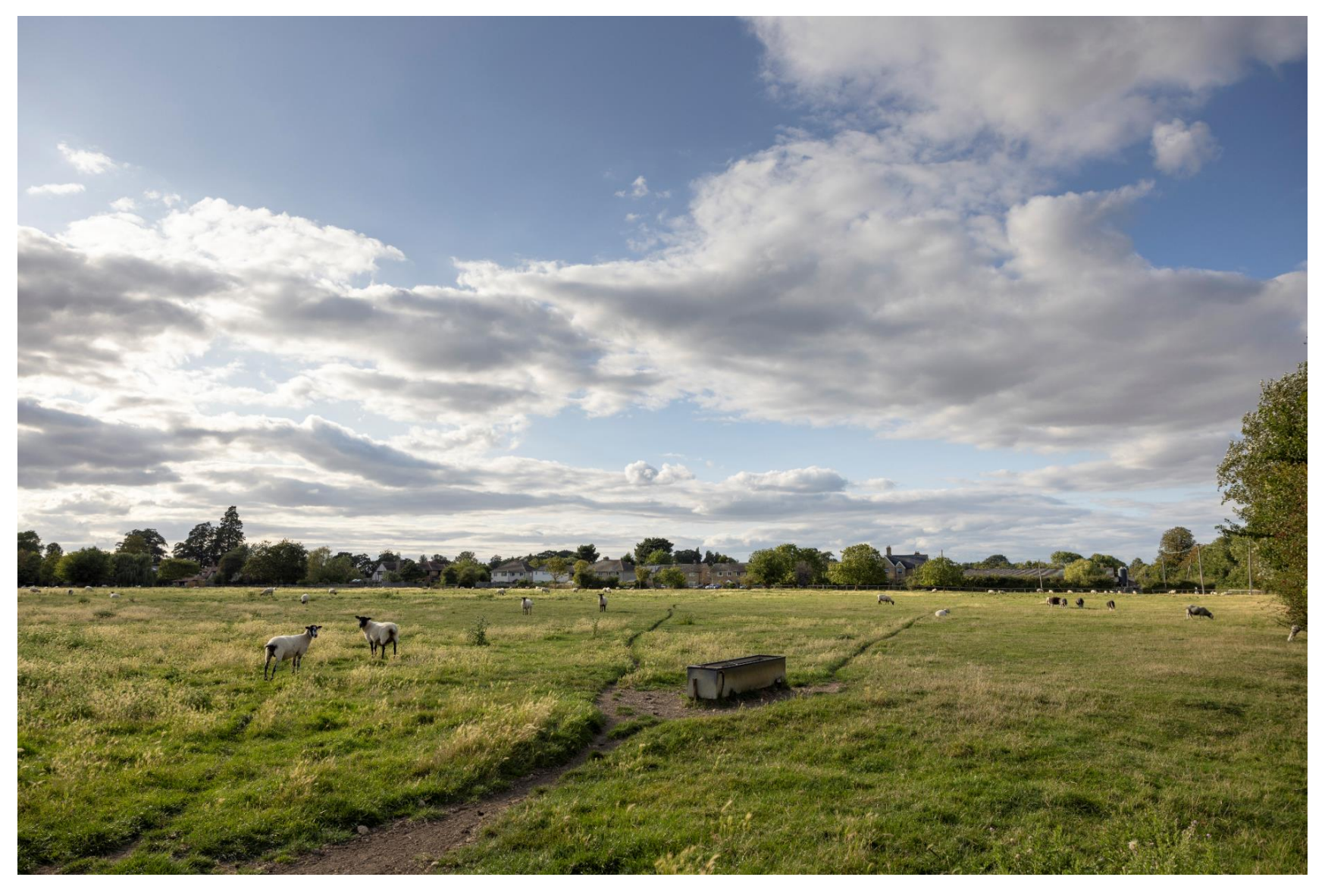
Conington (small village in South Cambridgeshire)