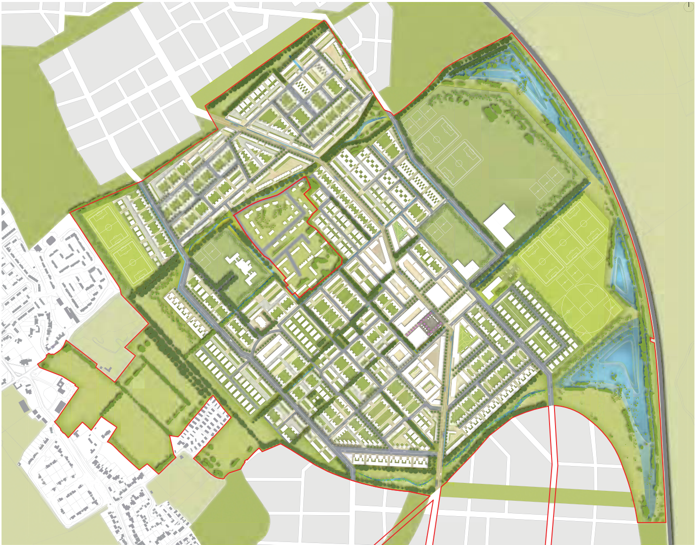
ABOVE: PHASE 2 ILLUSTRATIVE MASTERPLAN