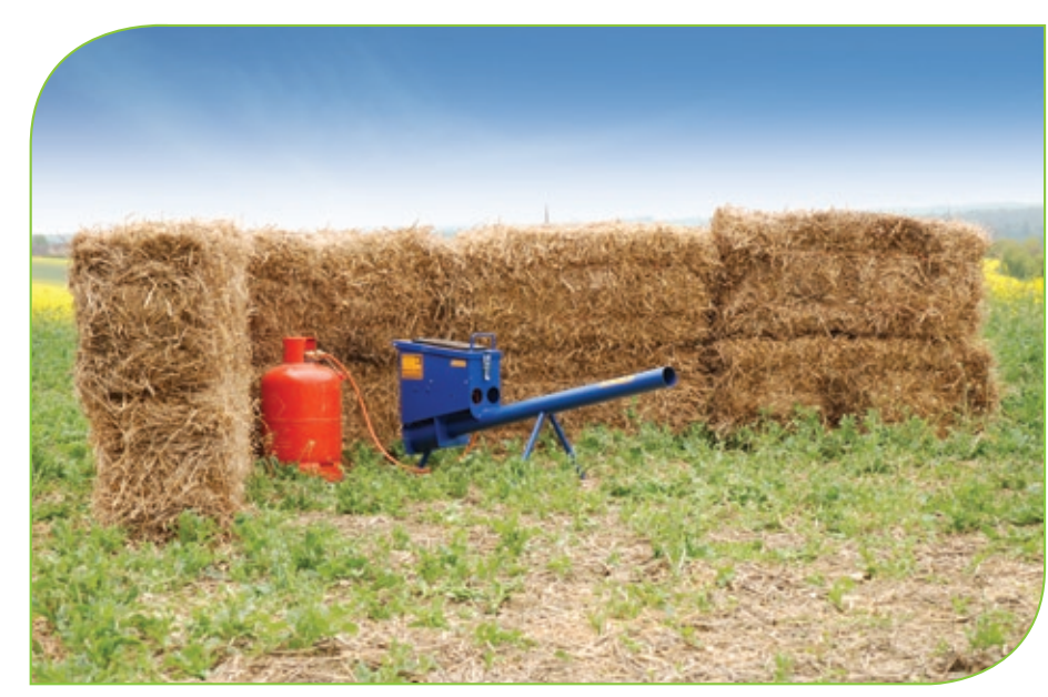
Auditory scarer with baffles

Some scarers and deterrents combine sound and visual stimuli.