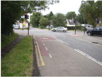
Advance stop lines are provided on the Regional Cycle network route at Oakington cross roads

5.5.4 Regional route 24 also provides a link for cyclists from Longstanton to Cambridge, via Oakington and Girton. Conditions for cyclists within Oakington itself are generally good and traffic volumes are considered to be acceptable. This route utilises a shared use footpath between Oakington and Girton. At Girton, although the route moves onto the carriageway, traffic must abide by a 30mph limit which is complemented by a traffic calming scheme. The heavily utilised route continues through to Cambridge, generally functioning well and providing a safe environment for cyclists with the context of a busy radial corridor.