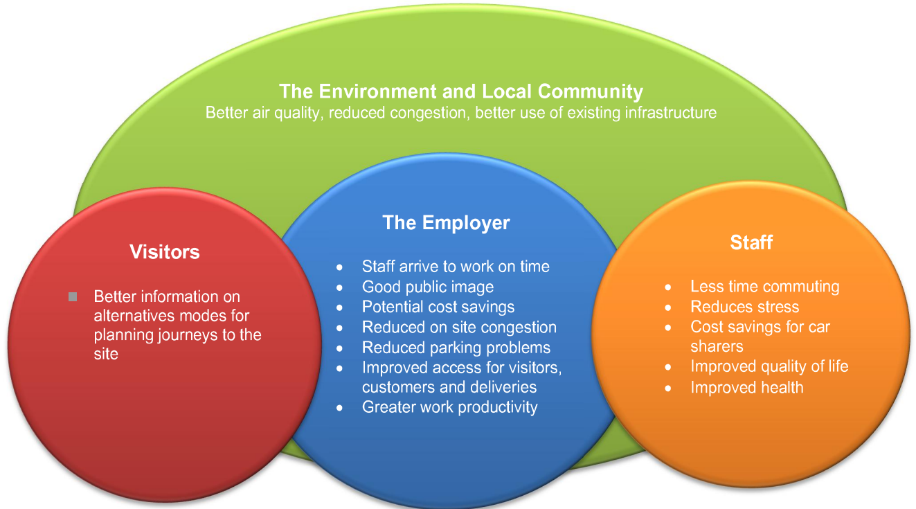
Diagram 2.1 – Potential Travel Plan Benefits

2.2.2 A summary of benefits arising from the introduction of a successful Workplace Travel Plan is illustrated in Diagram 2.1.