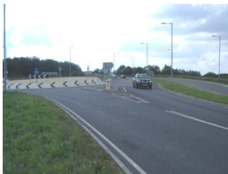
A number of junctions between Longstanton and Bar Hill do not present a cycle-friendly design.

5.5.3 The CGB, for which the public transport aspect will be detailed below, boasts an adjacent wide smooth blacktop surface which offers a traffic-free cycling super highway. The route runs along the northern perimeter of the site, heading east to Oakington, Histon and Cambridge, and west to Longstanton Park & Ride and Swavesey. From Swavesey it continues as a granular surface past the Fen Drayton Nature Reserve to the St Ives Park & Ride. Most stops along the guided section of The Busway provide covered, well lit and CCTV monitored cycle parking, providing an ideal opportunity for cyclists to both commute to work, or to use this route for leisure purposes.