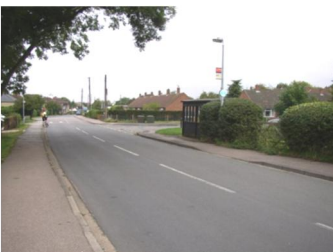
Longstanton High Street: conditions are relatively good for cyclists, with low traffic speeds assisted by some existing traffic calming