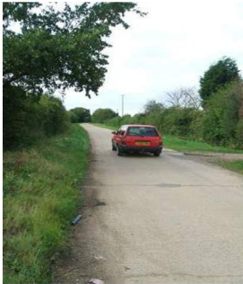
Rampton PROW at Cuckoo Lane

5.4.3 There is an existing link via a PROW running from the end of Rampton Road to Rampton village, which crosses the CGB line. On the Longstanton side of the CGB line the path is unsurfaced. The section to the east of the line is similarly unsurfaced and suitable for use as a leisure route. The path is a reasonable width (about 2m) throughout. There is no footway where the PROW emerges onto Cuckoo Lane although the road is a dead end providing vehicular access only to a breakers yard.