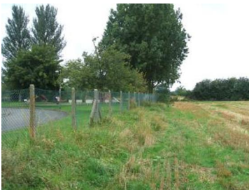
Public Footpath adjacent to Magdalene Close

5.4.2 Additionally the public footpath from St Michael's Lane to the south-east of Longstanton, across Rampton Road and through the golf course to Station Road north of the village, provides a route adjacent to the new development. This route is off-road, unsurfaced and narrow through stiles and other access barriers.