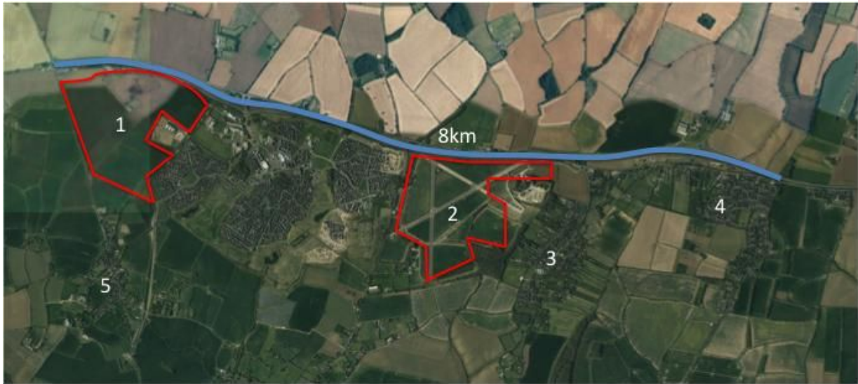
Figure 1: Bourn Airfield with West Cambourne and existing settlements