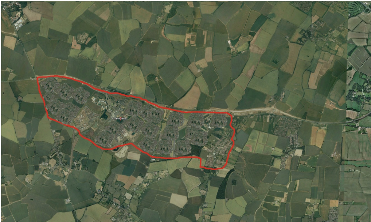
Figure 2: If Bourn Airfield goes ahead – urban sprawl in a rural setting