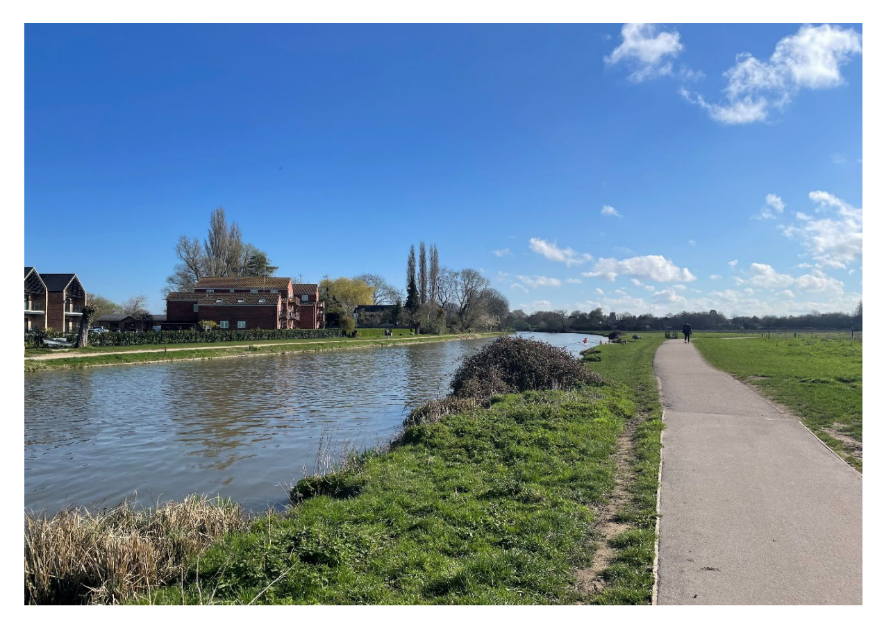
E. View N along Cam from Stourbridge Common towards Fen Ditton