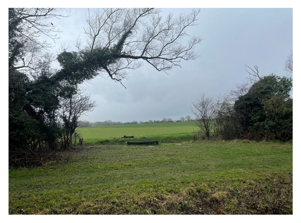
C. Panoramic view from west end of Avenue looking in direction of appeal site