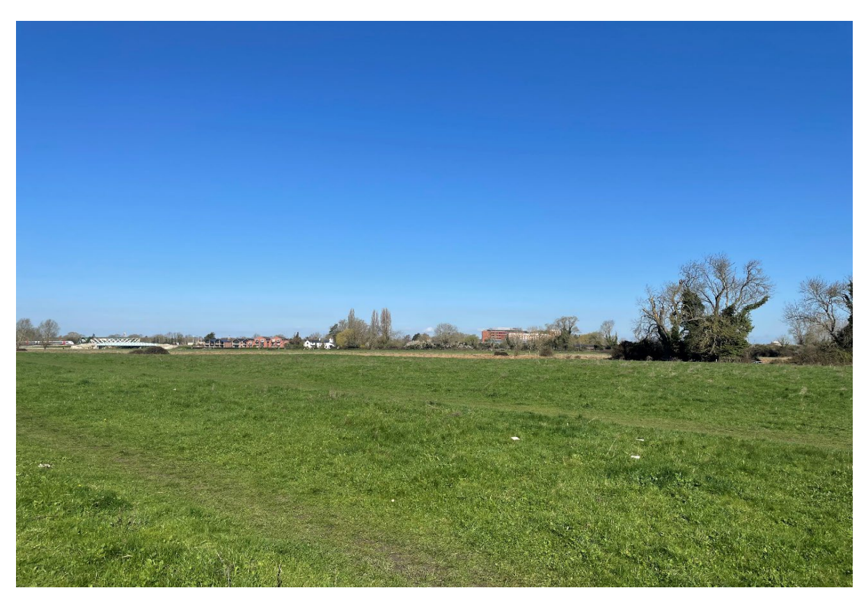
D. Fen Ditton – view from Ditton Meadows looking towards Stourbridge Common