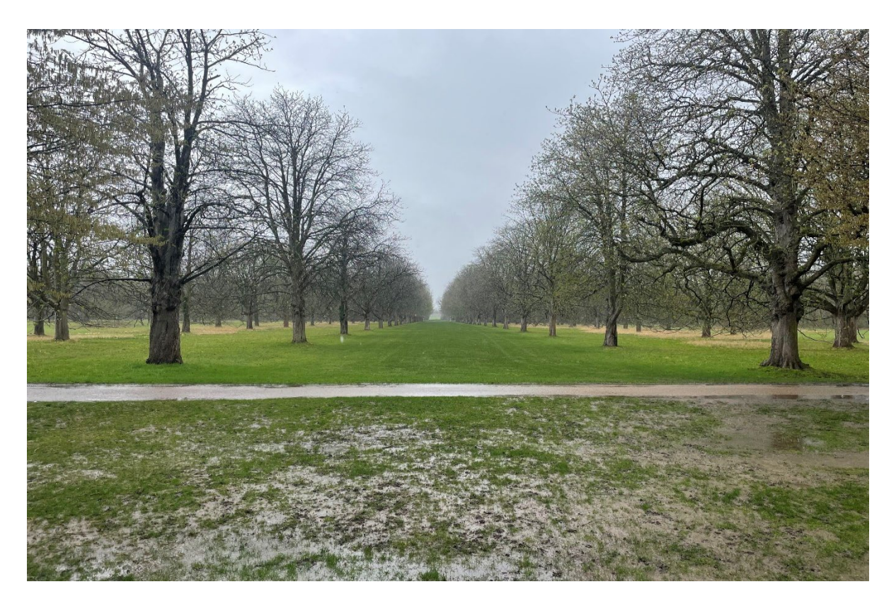
A. Long view down Coronation Avenue at Anglesey Abbey to western boundary