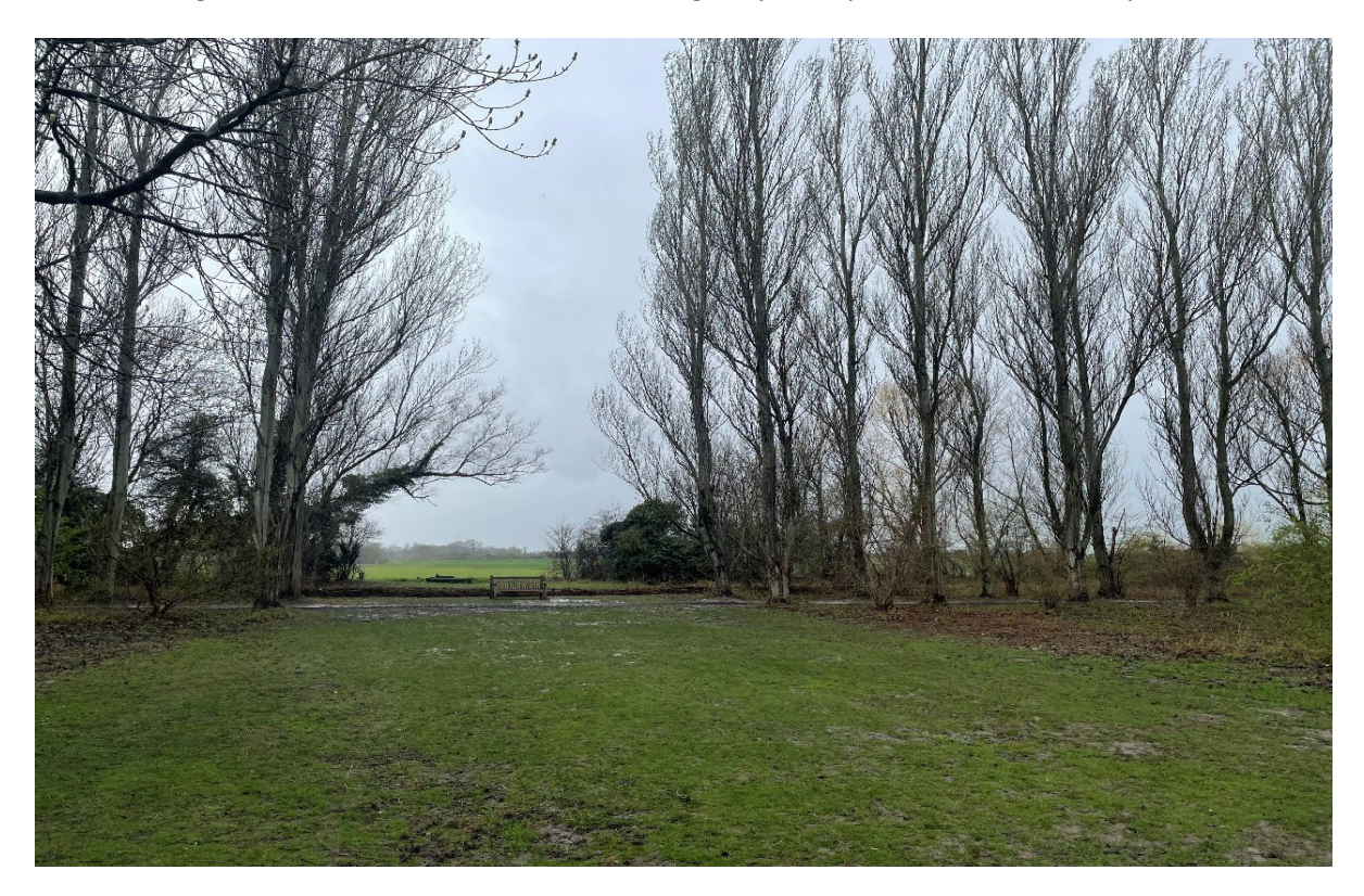
B. Approaching the western end of Coronation Avenue