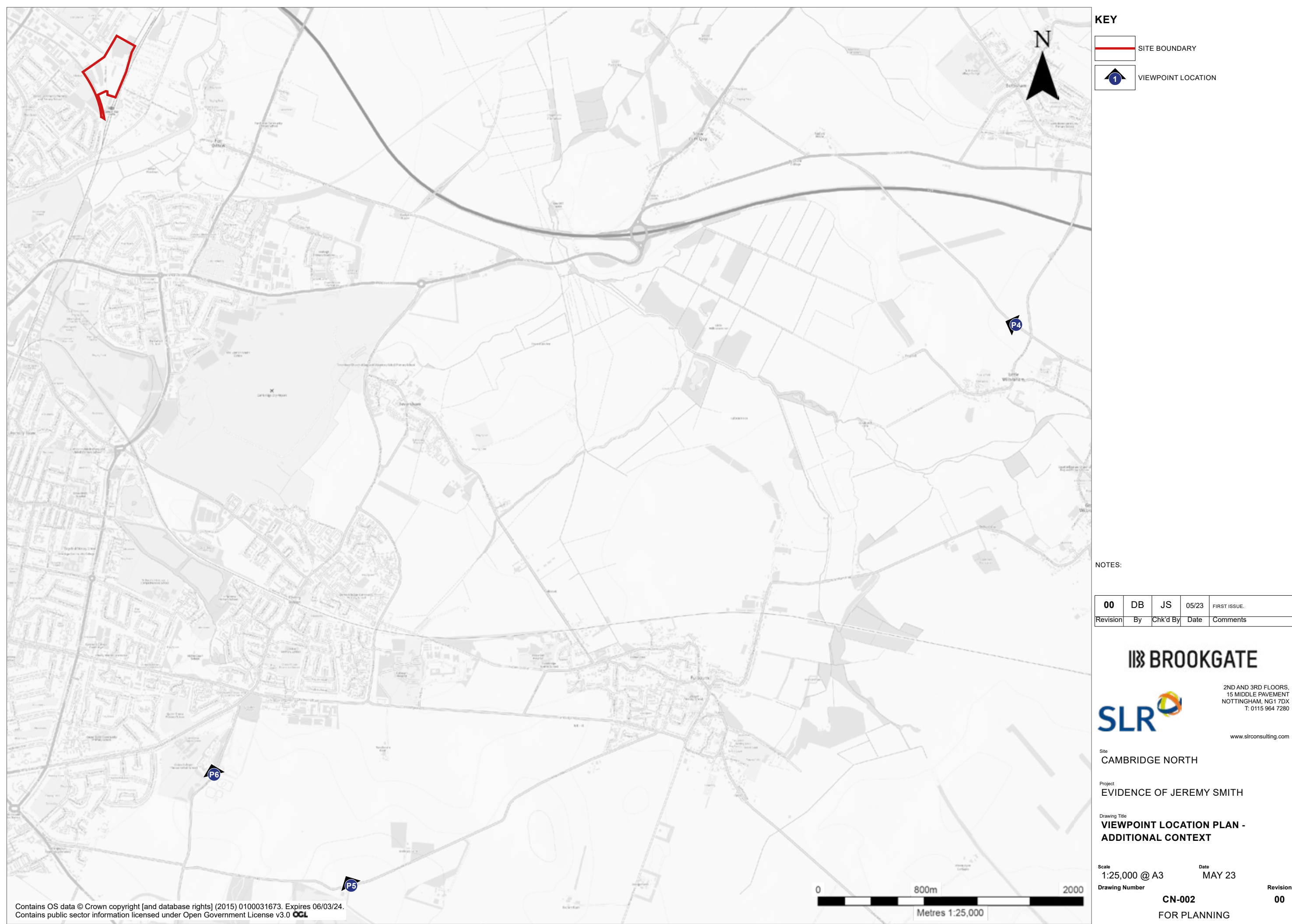
© This drawing and its content are the copyright of SLR Consulting Ltd and may not be reproduced or amended except by prior written permission. SLR Consulting Ltd accepts no liability for any amendments made by other persons.