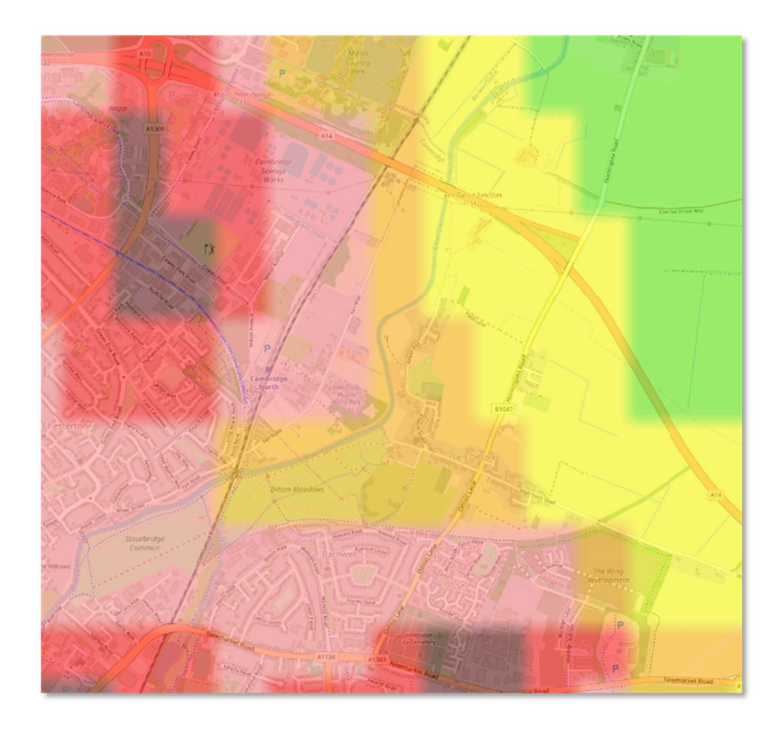
Plate IX: Extract from the CPRE Dark Skies Map, illustrating that the appeal site and development on Fen Road is strongly influenced by existing light sources. The Cam Valley landscapes (Ditton Meadows, Stourbridge Common) are also influenced by light sources to the west, south and east.

Appendix 13.2 of the ES includes further details about existing light sources on the site, and it is notable that some of the pedestrian areas outside of the station have a lighting level of over 100 lux.