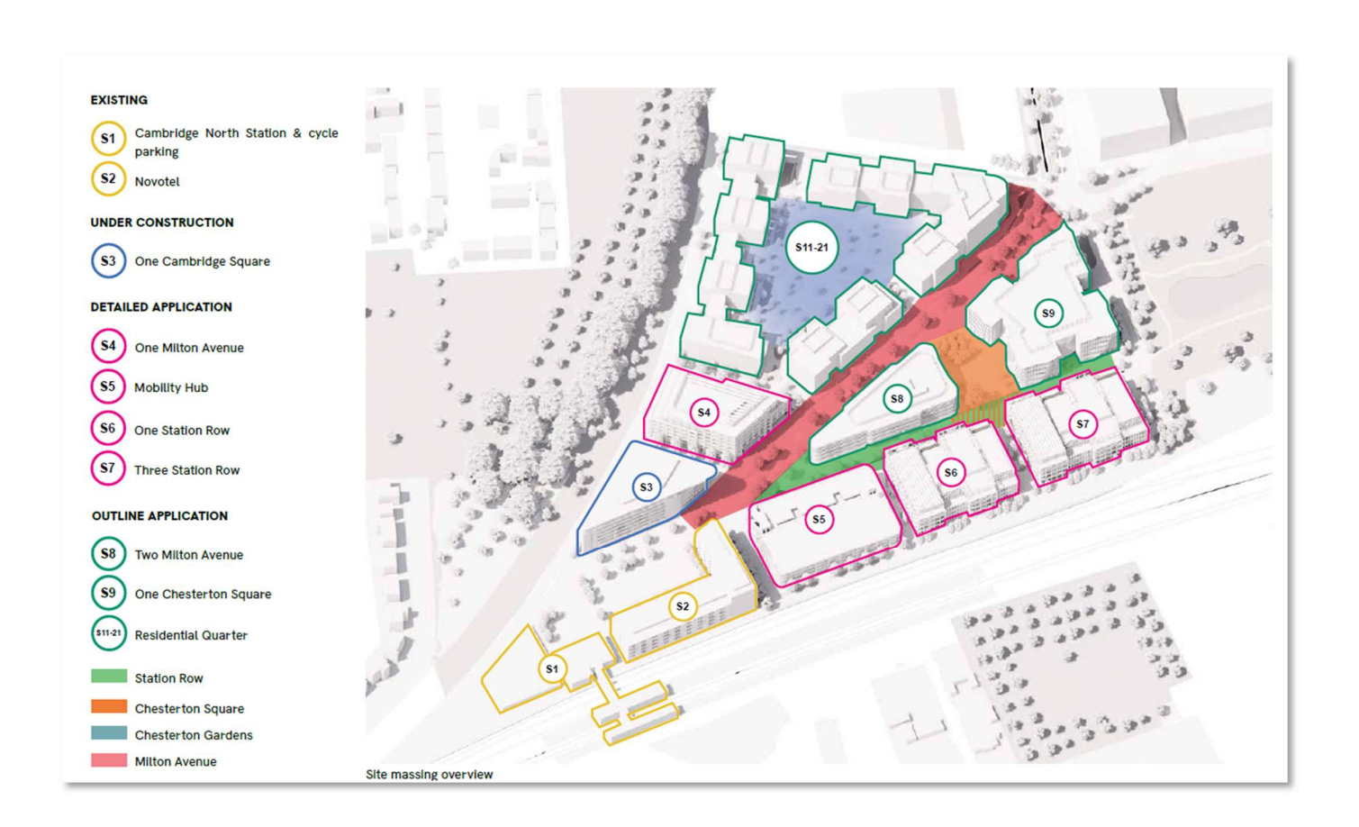
Plate II: Three-Dimensional computer model of the Appeal Proposals, (extracted from page 106 of the DAS).