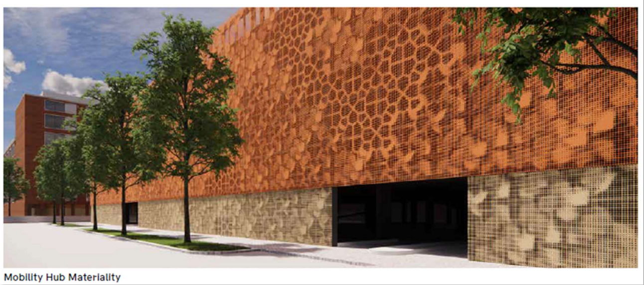
Plate III: Cambridge Paste Present and Future Feedback Response (October 2022): Page 10: diversity in the articulation, roof height and materials used on buildings S6 and S7 (top image) and the mobility hub (lower image).