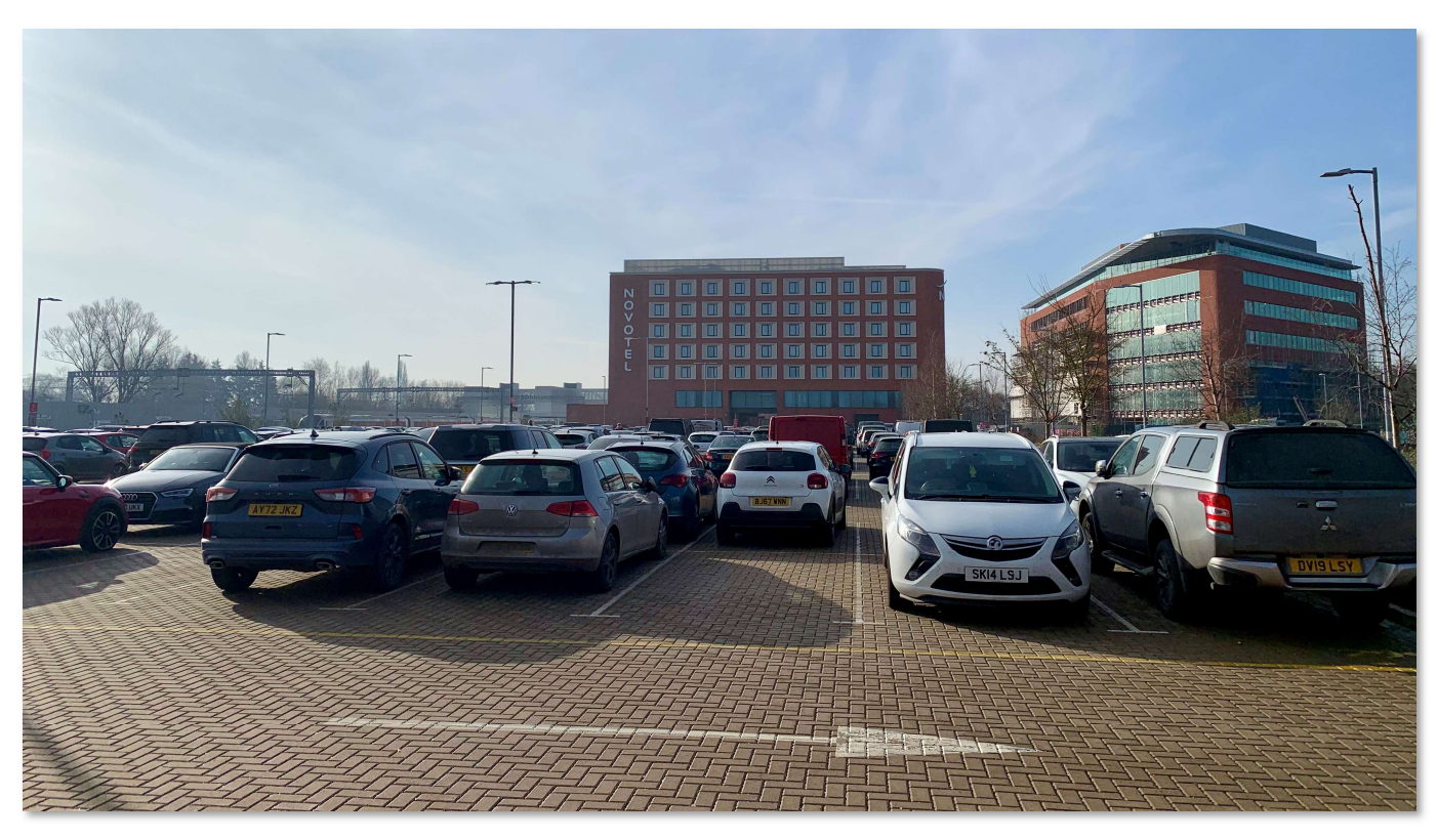
Plate V: photograph taken from the centre of the appeal site (and Parcel 10), looking towards the Novotel at the centre, and One Cambridge Square to the right. Overhead electrical infrastructure for the railway line can be seen to the left of the view. The foreground is occupied by the station car park.

As the Bidwells LVIA correctly notes (see paragraph 12.125), the character of this area "has experienced rapid change with the construction of Cambridge North Station and the Novotel", and this change has continued with the construction of One Cambridge Square, see plate V, below.