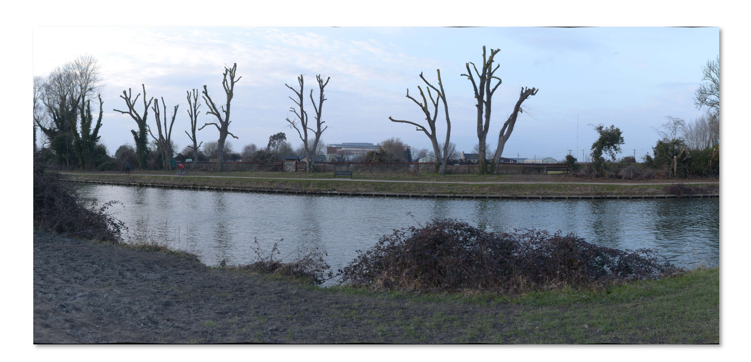
Plate X: Photograph taken from Harcamlow Way in Ditton Meadows, showing how recent arboricultural works on the trees to the west of the Cam permit views towards the appeal site, including the existing Novotel and One Cambridge Square building.