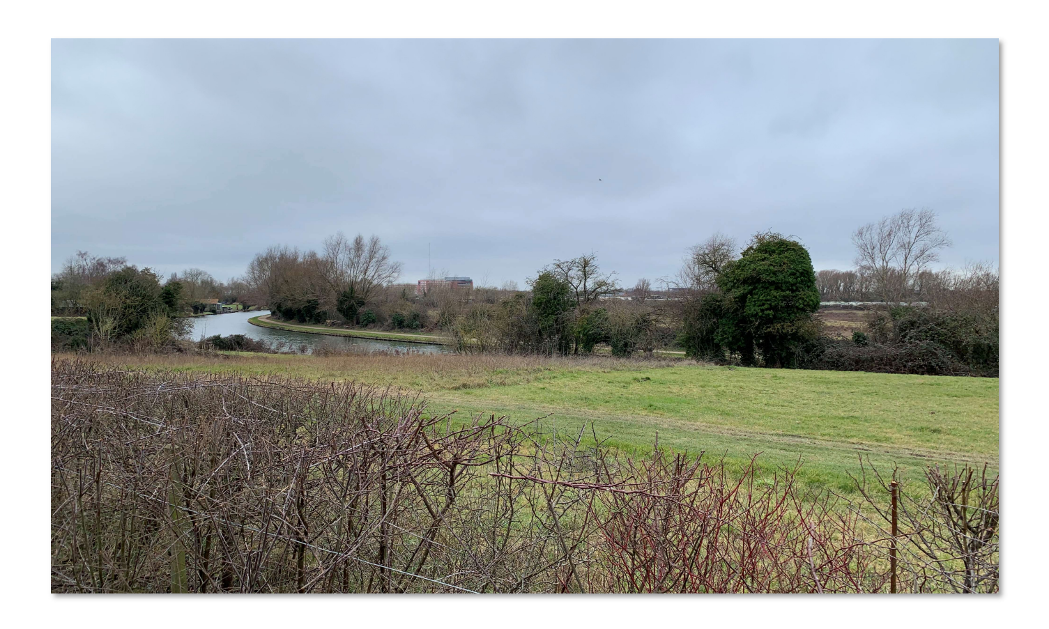
Plate VII: View over sloping meadows towards the River Cam. The Novotel and One Cambridge Square are visible on the skyline, and existing single storey structures on Fen Road can also be seen in the middle ground.

railway line and also the numbers of people using foot and cycle paths and enjoying the open grassland in the summer months.