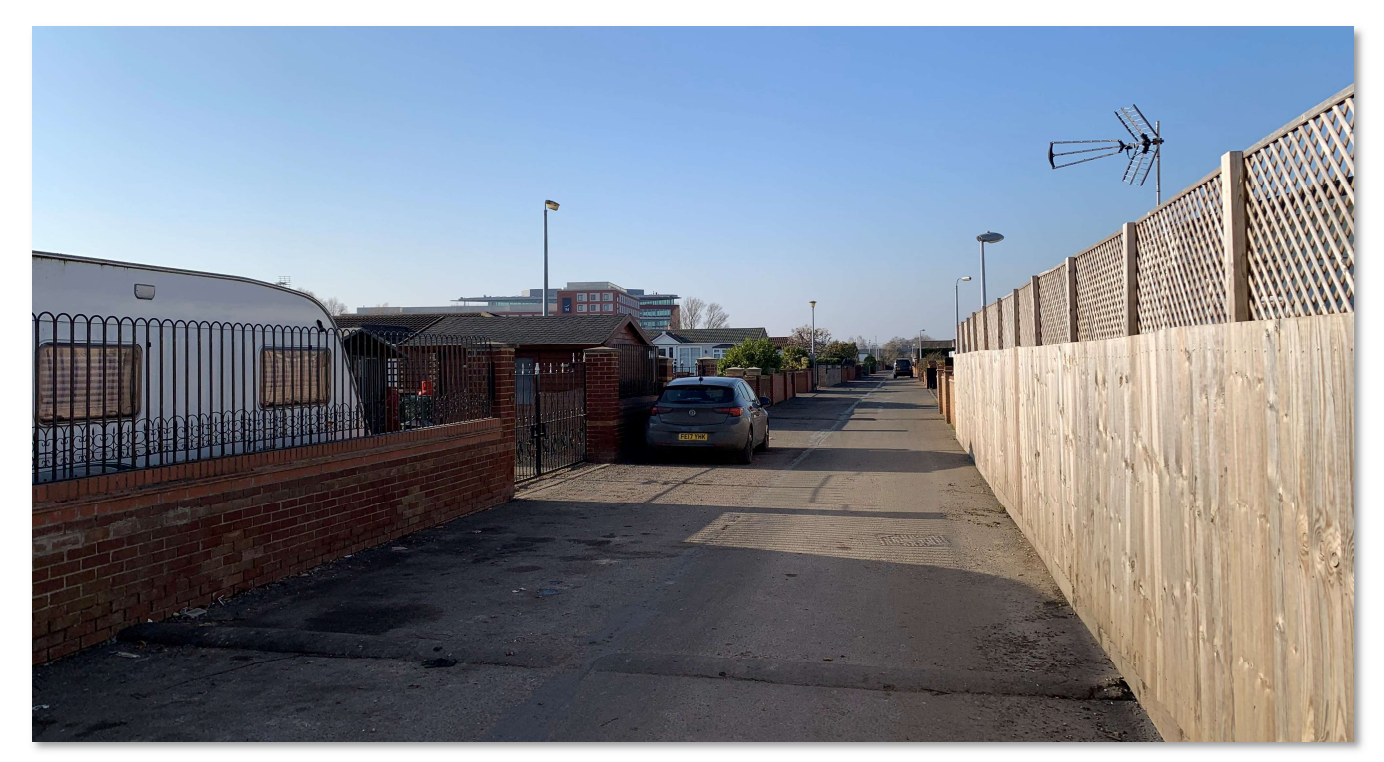
Plate VI: View towards the appeal site from Fen Road, illustrating predominantly single storey residential development.