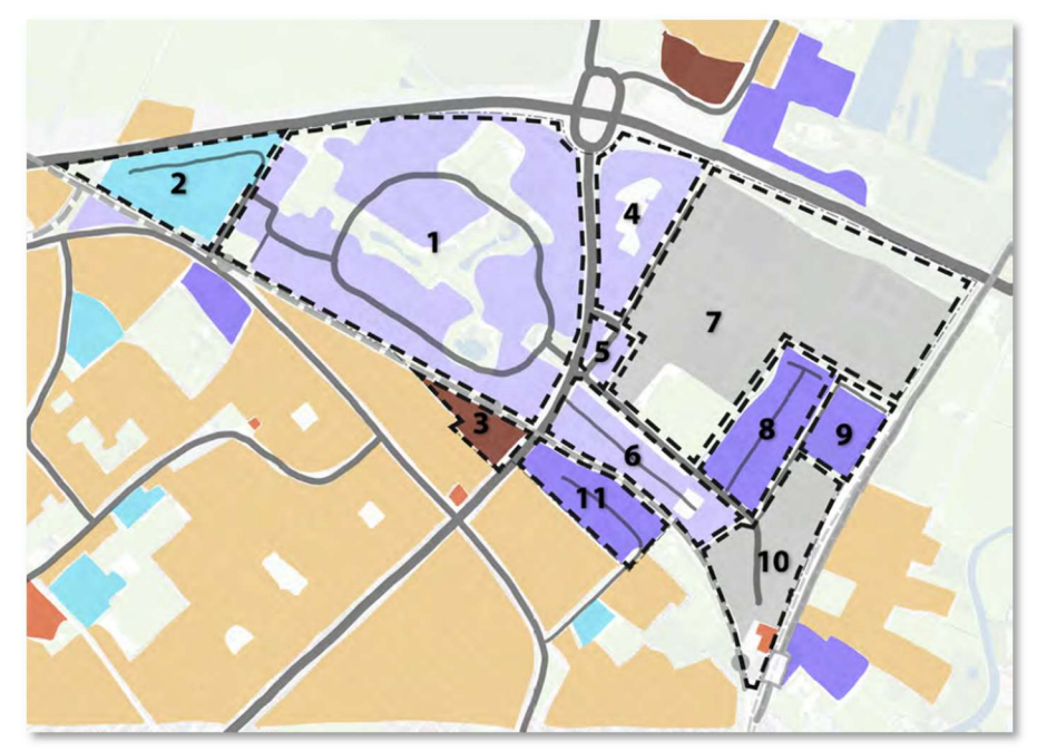
Plate IV: figure 5.1 from the NEC Townscape Assessment character analysis. The appeal site is wholly within parcel 10, Cambridge North Station

The Townscape Assessment provides a further level of detail regarding townscape character within and around the appeal site, dividing the site into "parcels with their own character" (see Plate IV, below) The appeal site is classified as being within land parcel 10, Cambridge North Station, with parcel 6 to the west (Cambridge Business Park), and parcels 8 and 9 to the north (Cambridge Commercial Park/ Cowley Road industrial estate and Chesterton Railhead aggregate site respectively).