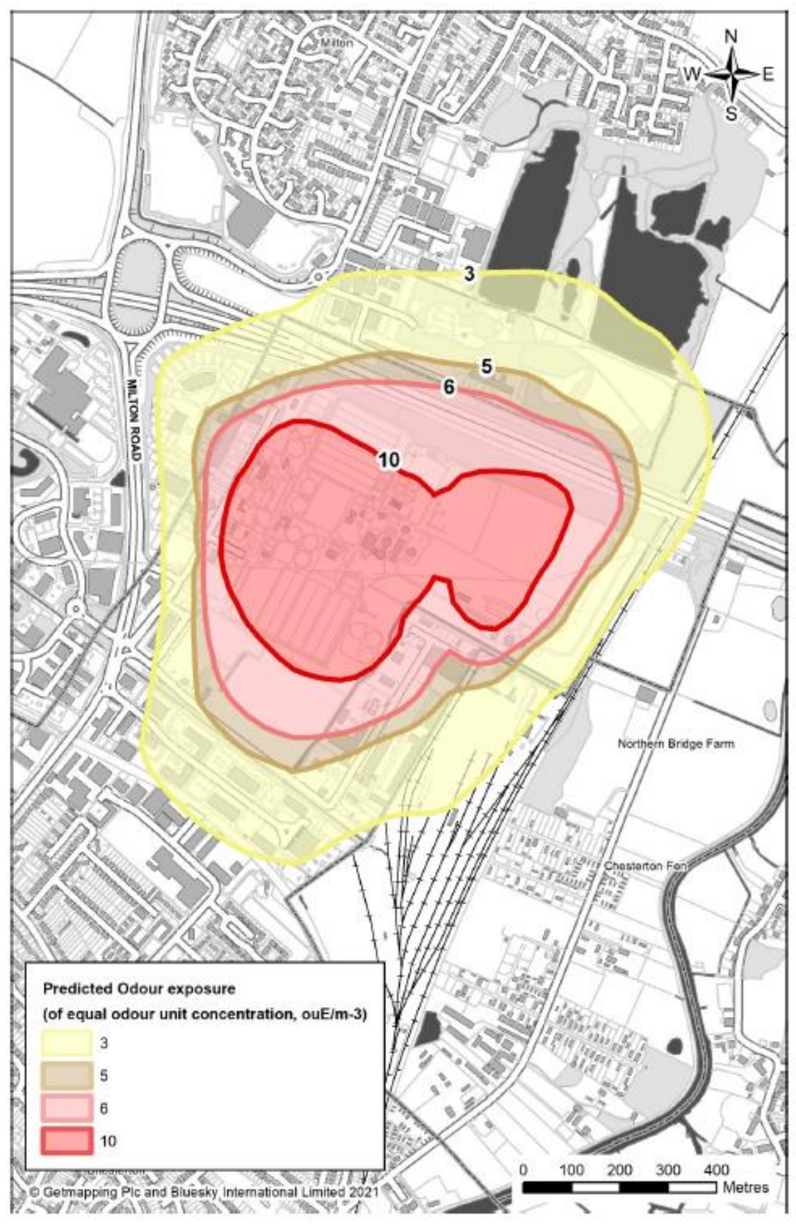
Figure 2: Odour exposure contours around CWRC - extracted from the Technical Note produced by CCC