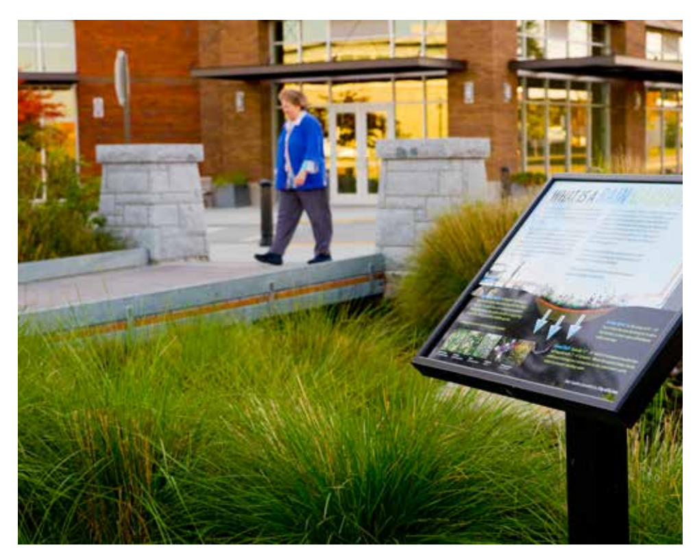
Interpretation board explaining ecology and SUDs principles