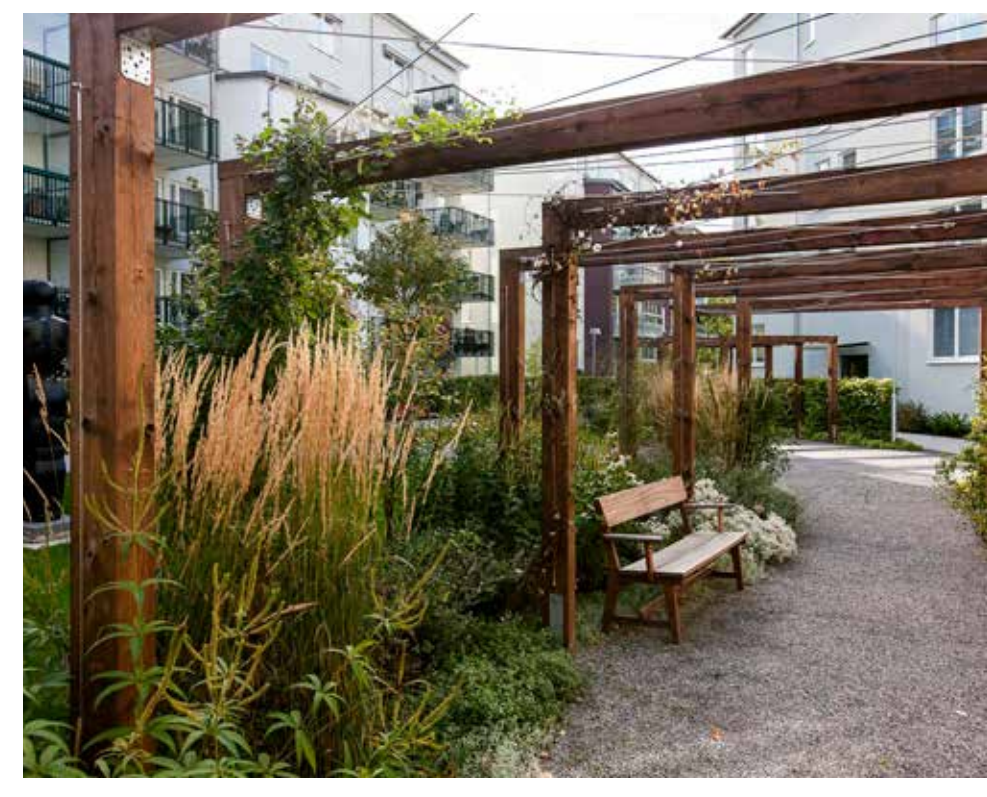
Irregular chunky oak pergola