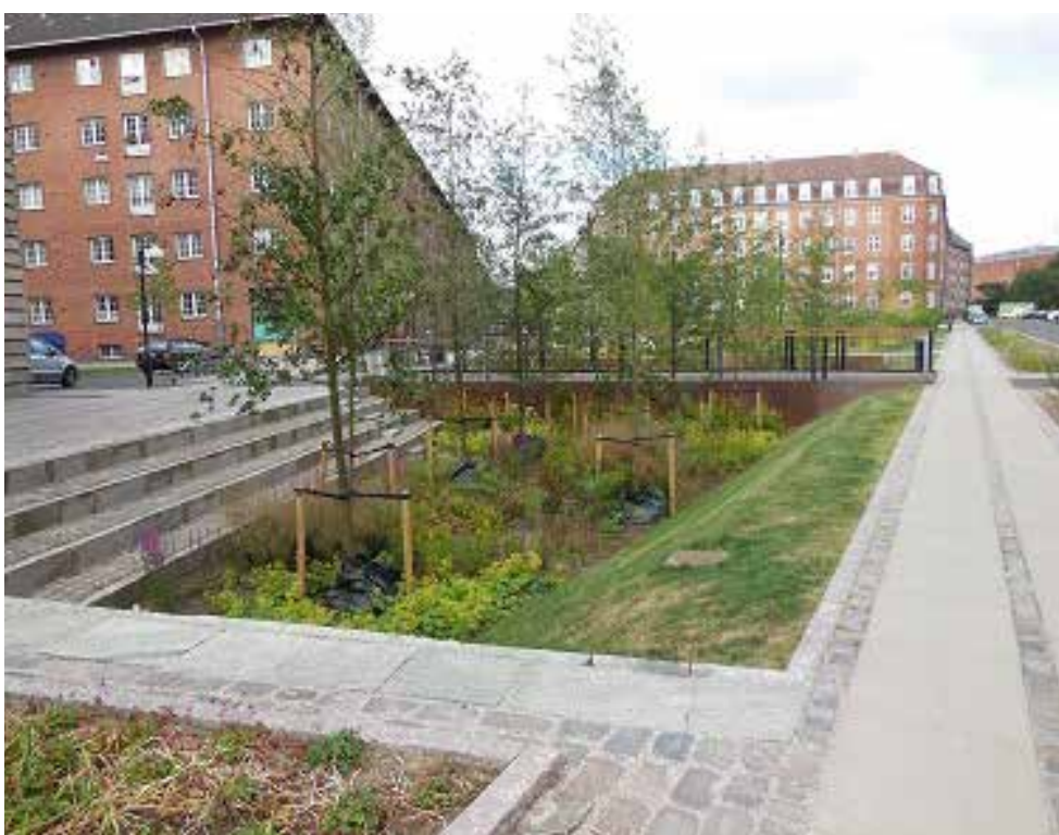
Wide steps down to water margin