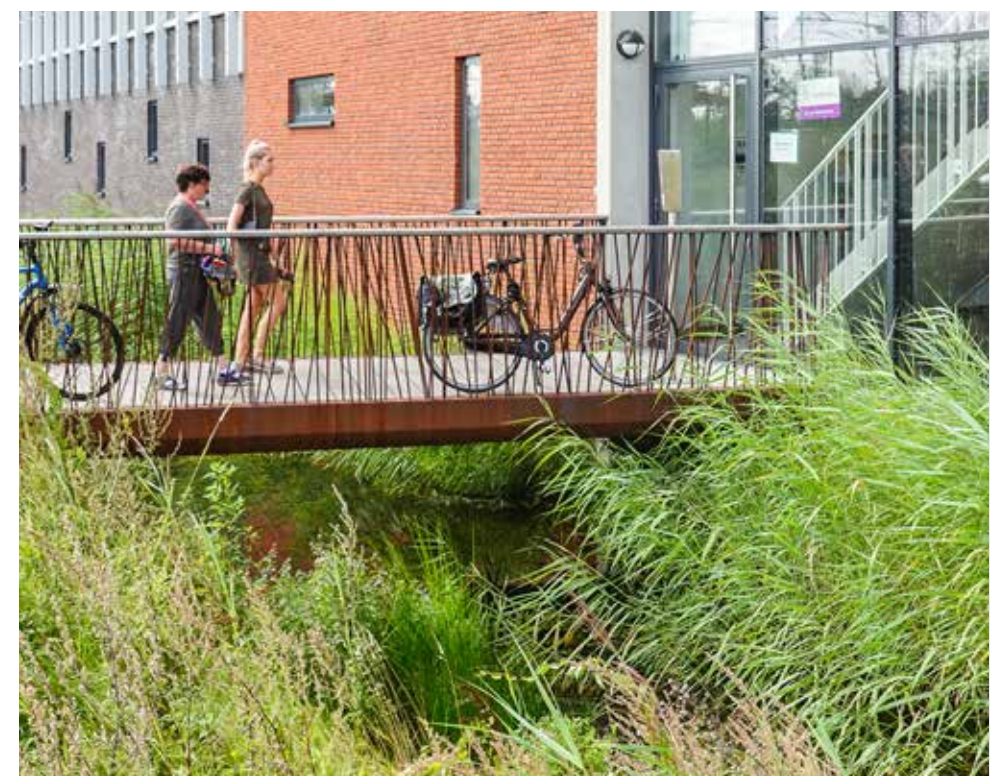
Narrow causeways to have visually permeable railing