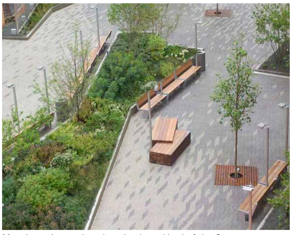
Mosaic paving evokes the mixed seed bed of the Open Mosaic Habitat (OMH)