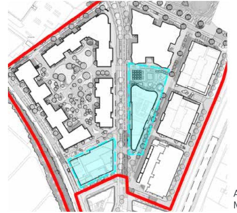
Areas of Meanwhile Use

Further construction of residential spaces would provide the interest and population for a community garden space, set up with raised beds in part of the meanwhile space. Demand for growing space could also be satisfied by an extension of the community gardens, to the empty sites at the future 1 Milton Avenue and the Meanwhile Space on the triangle site helping to activate these areas. When the final buildings are complete, the community gardens would be incorporated into future allotments or integrated growing as part of the next phase of residential development to the north of Cowley Road.