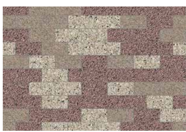
CYCLE PATH: PINK TONED VARIATION ON CHESTERTON SQUARE