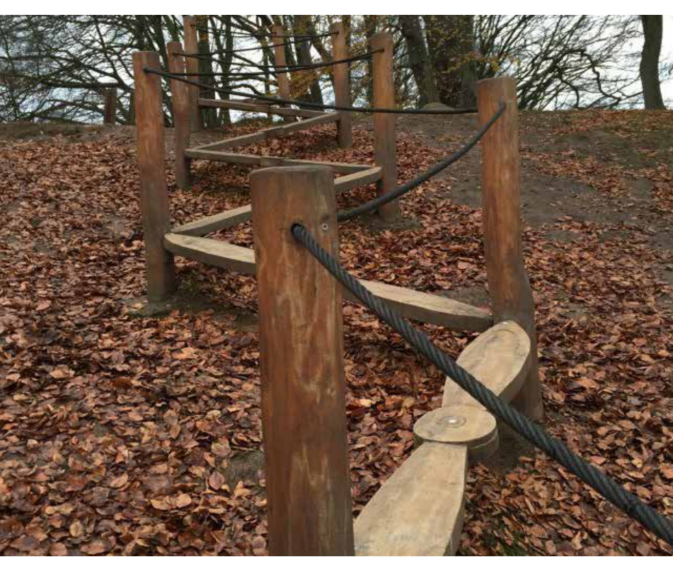
Timber balancing equipment