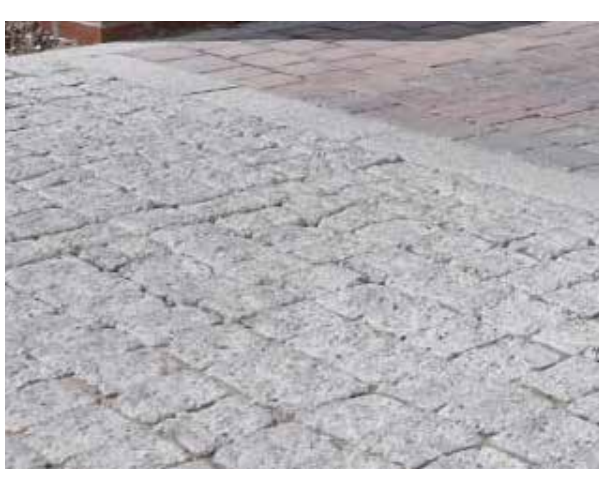
GRANITE SETTS, BOTH FLAMED AND TUMBLED