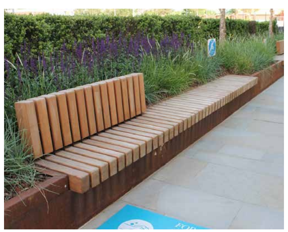
Corten seating with timber benches, backed by spilly contemporary planting