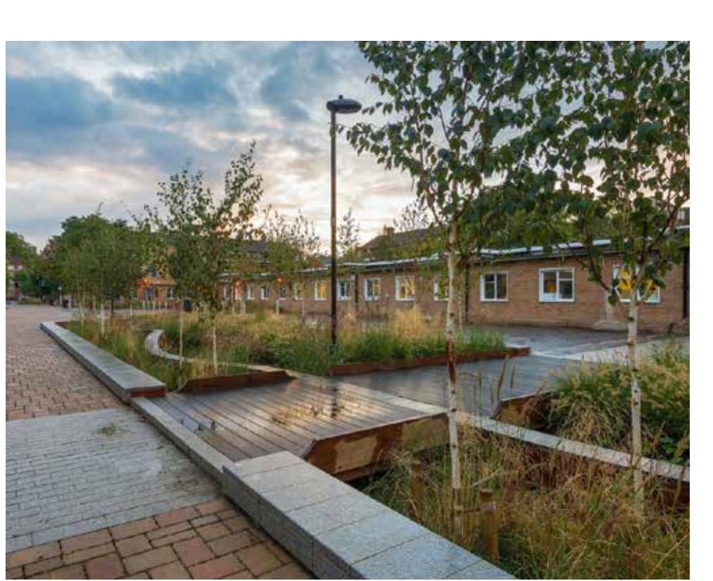
Naturalistic moisture tolerant planting