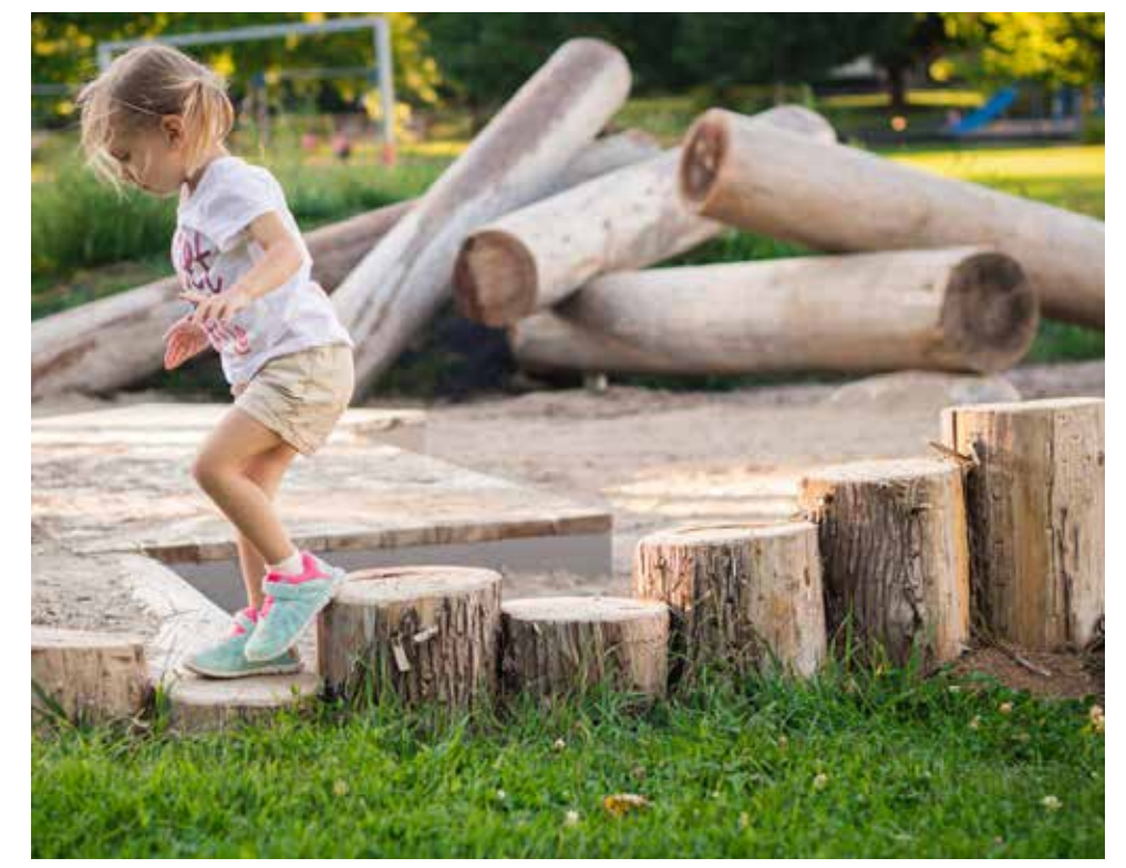
Multiple locations of natural play elements