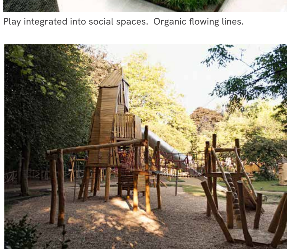
High quality, timber-based play equipment