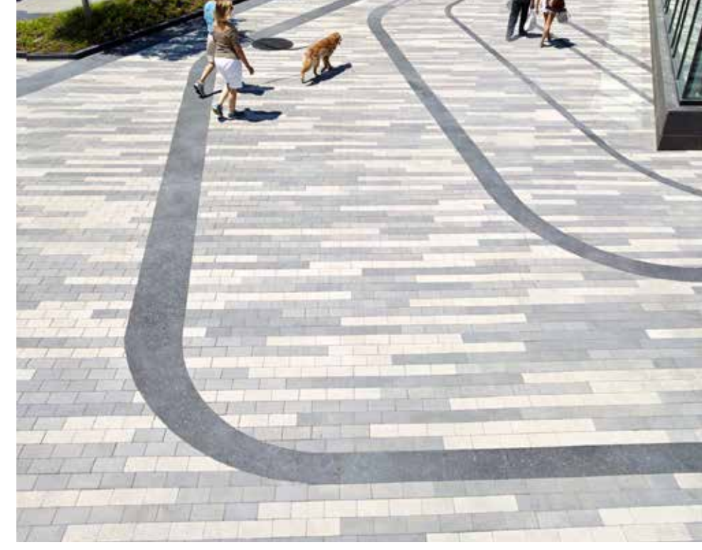
A continuous wide paving band turns and diverts, evoking a journey and rail sidings