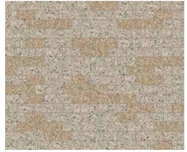
BUFF CONCRETE PAVING IN RANDOM 'HALF AND WHOLE' MIX