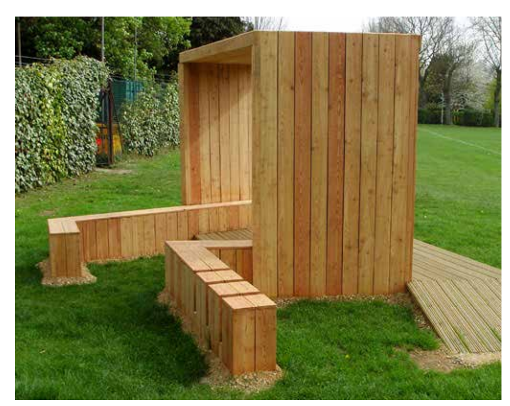
Timber structure/shelter for informal seating