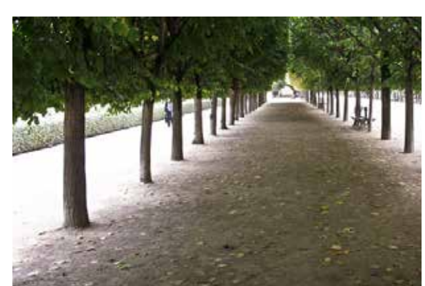
SELF BINDING GRAVEL UNDER TREES