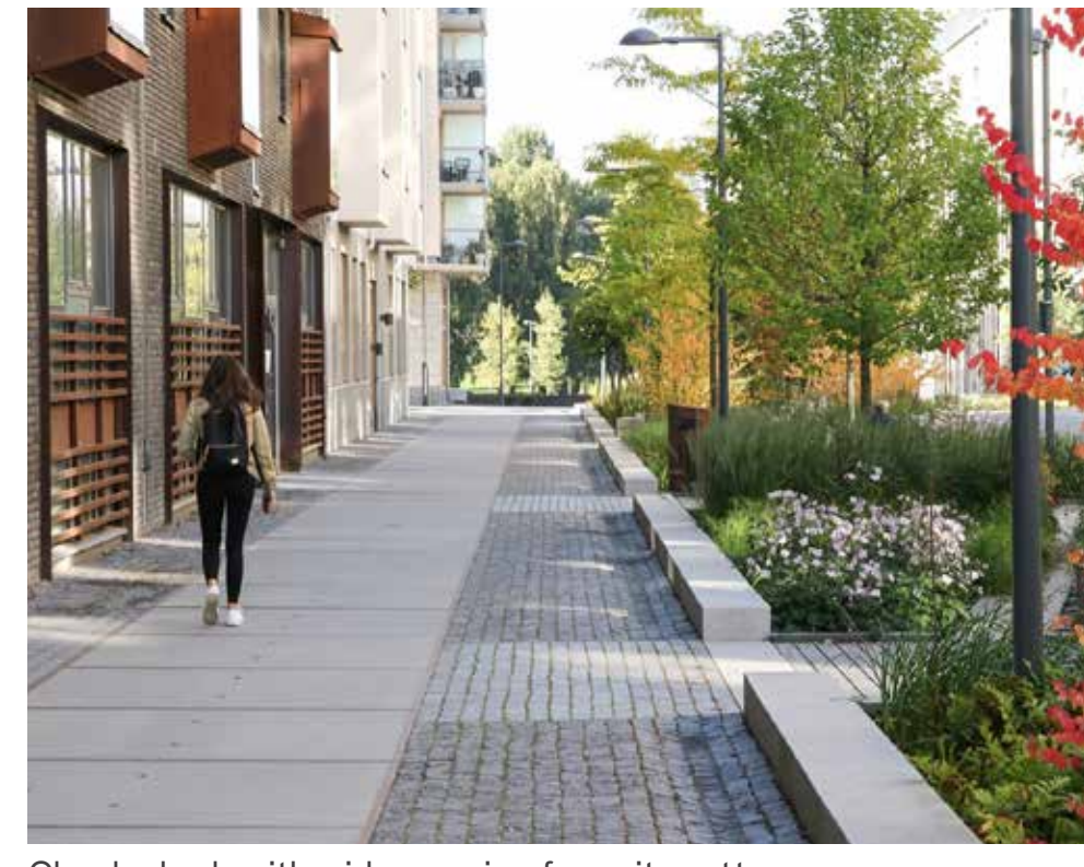
Chunky kerb with wide margin of granite setts