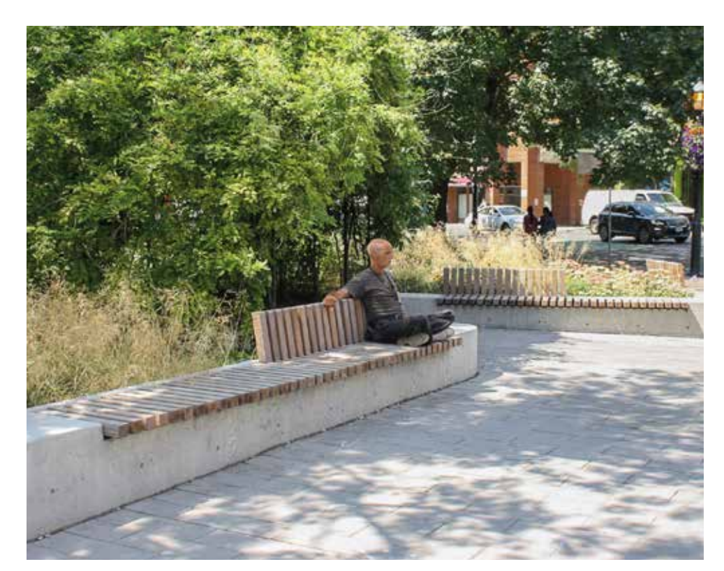
Hardwood timber slatted seating atop concrete base