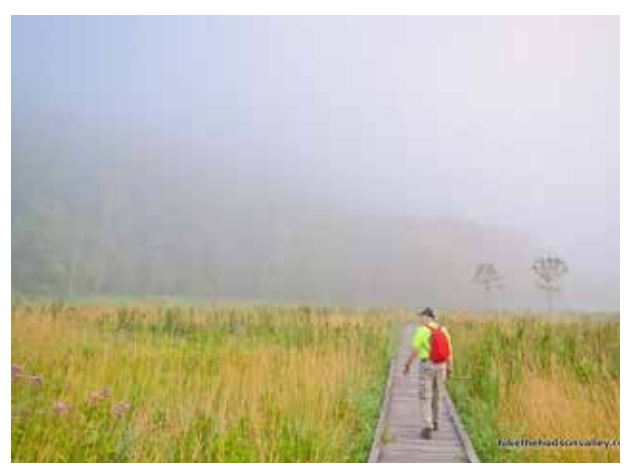
BOARDWALK OVER OPEN MOSAIC HABITAT