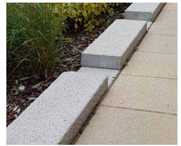
CHUNKY CONSERVATION KERBS