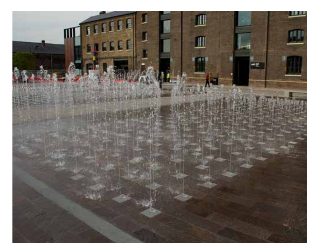
Jet fountain feature to be enjoyed by all ages