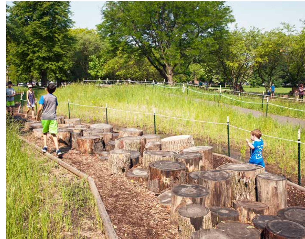
Multiple opportunities for natural play