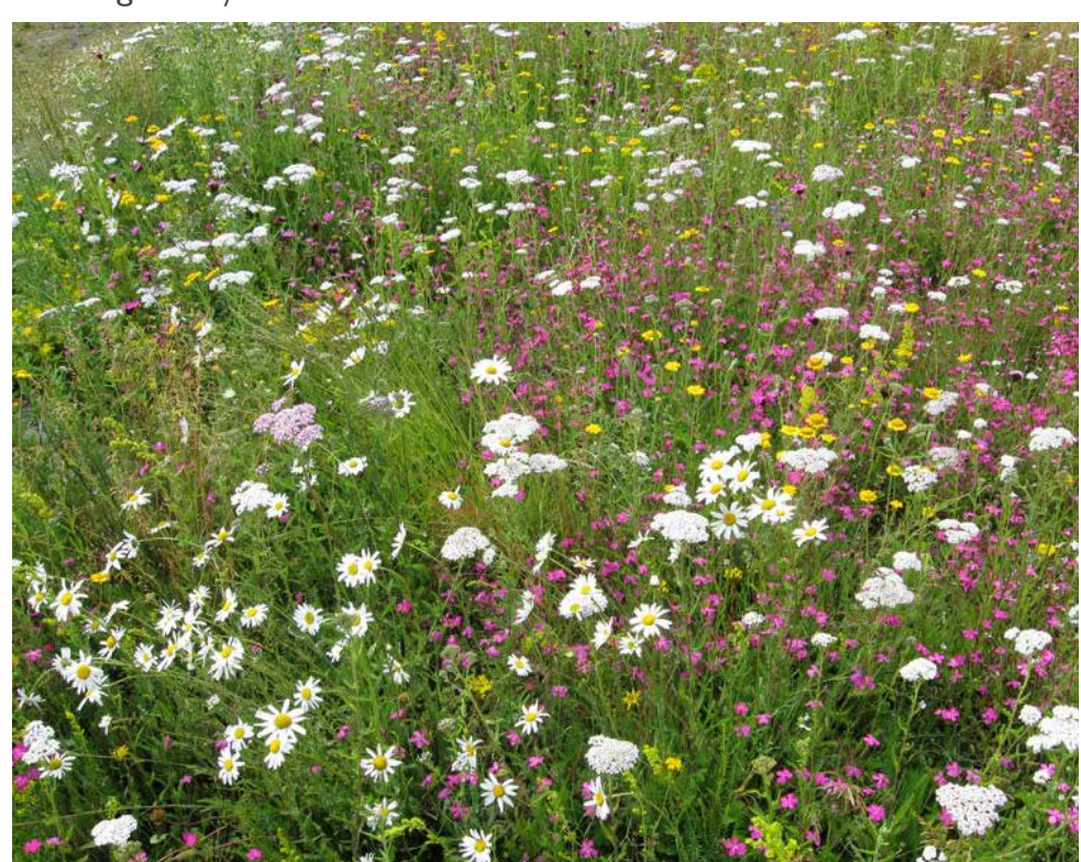
Open Mosaic species supplemented with additional seeding of the same and compatible species seed mix