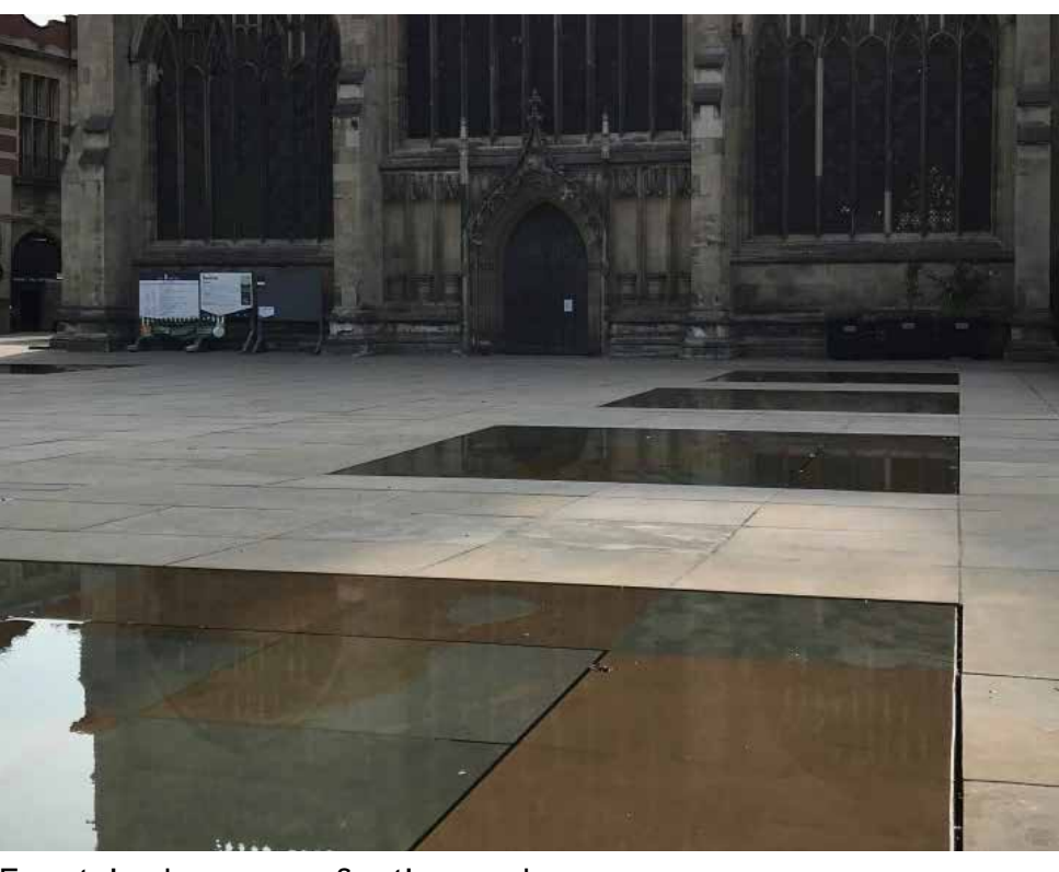
Fountains become reflecting pools