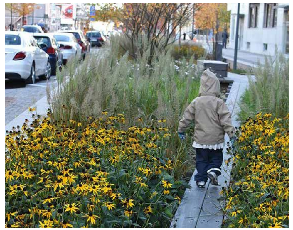
Narrow planks shortcuts into play area add adventure