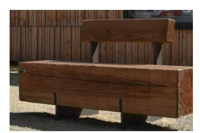
ROUGH TIMBER & 'FOUND' OBJECTS