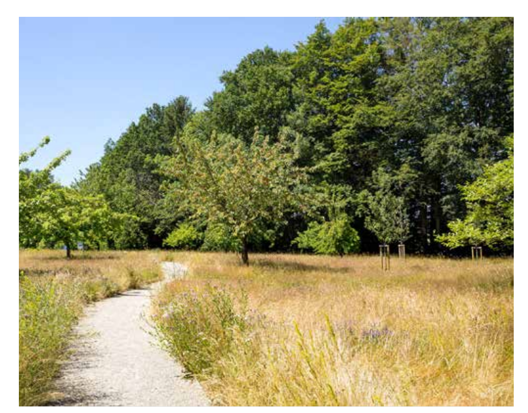
Breedon gravel surfaced paths through meadow grassland existing trees/scrub