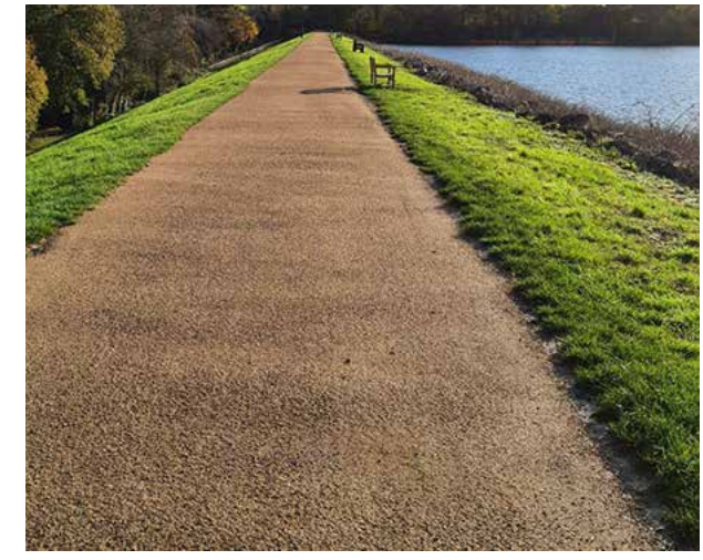
BREEDON GRAVEL PATH WITH INFORMAL EDGE