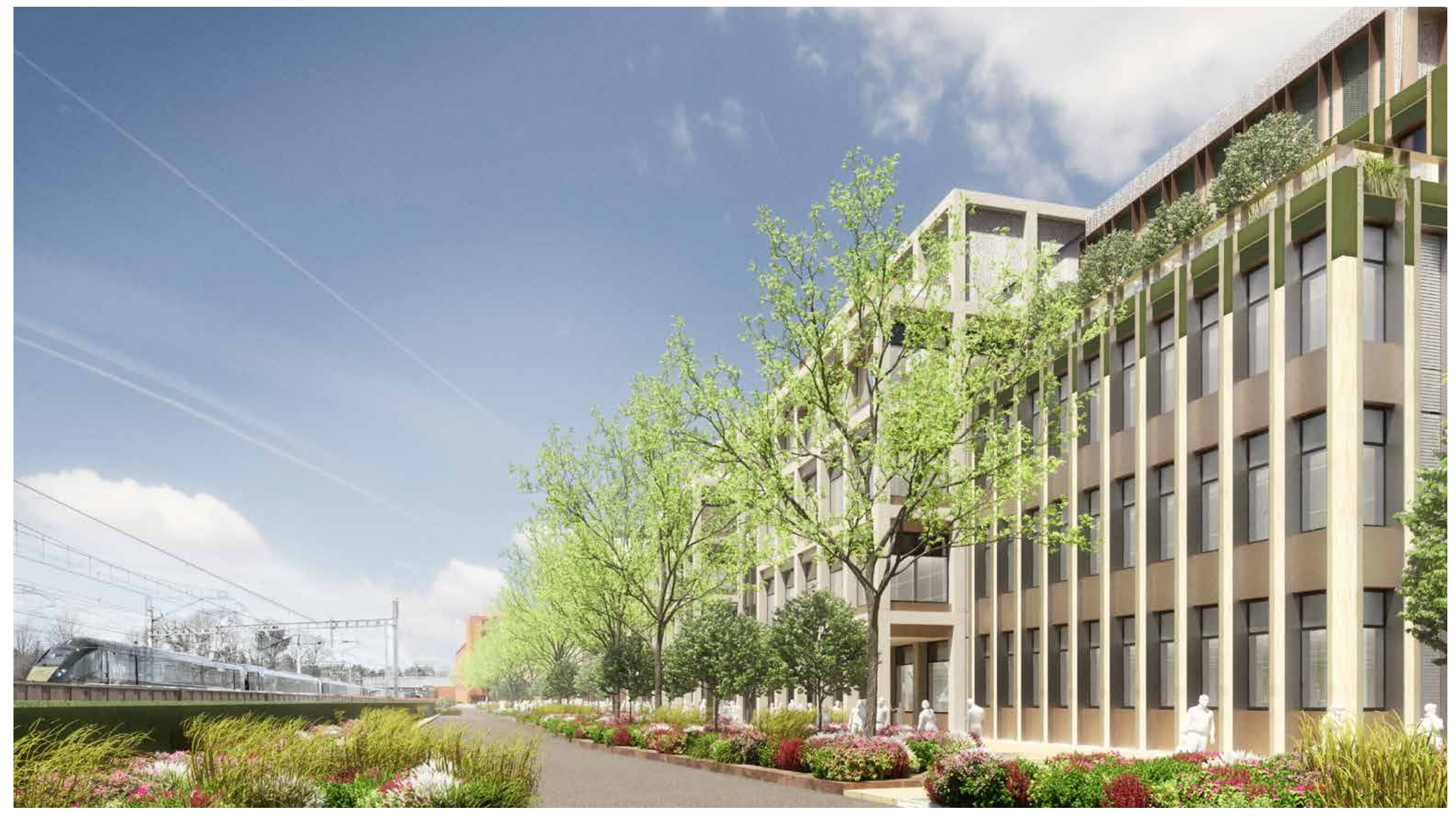
Illustrative view of 3 Station Row looking south along Cowley Road (South) — landscaped greenery removed from terrace for clarity.