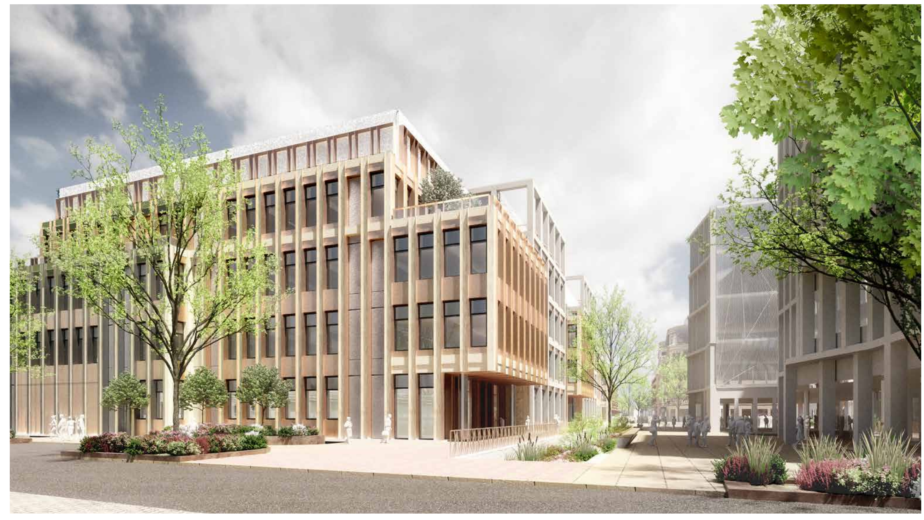
Illustrative view of 1&3 Station Row viewed from the junction of Cowley Road and Station Row looking south.