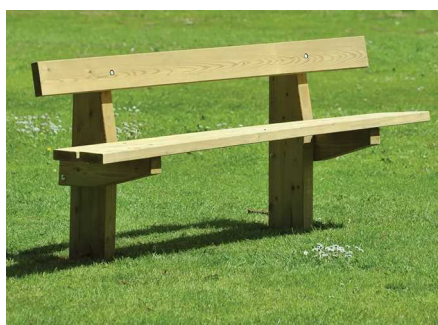
Edale Rustic 3-slat bench

For boardwalk details refer to Hard Landscape Strategy