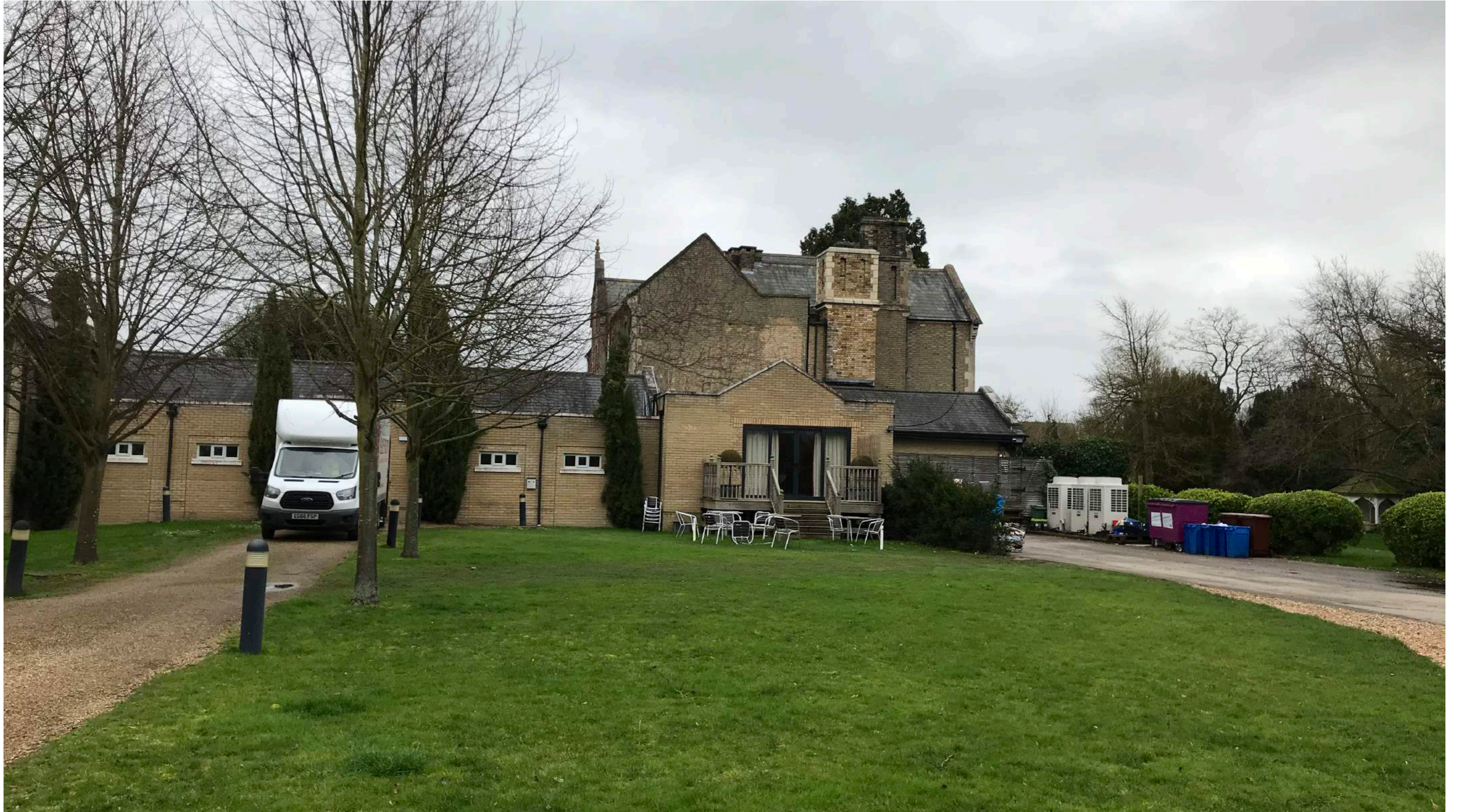
NO SUITABLE ACCESS TO UTILIZE REAR GARDEN