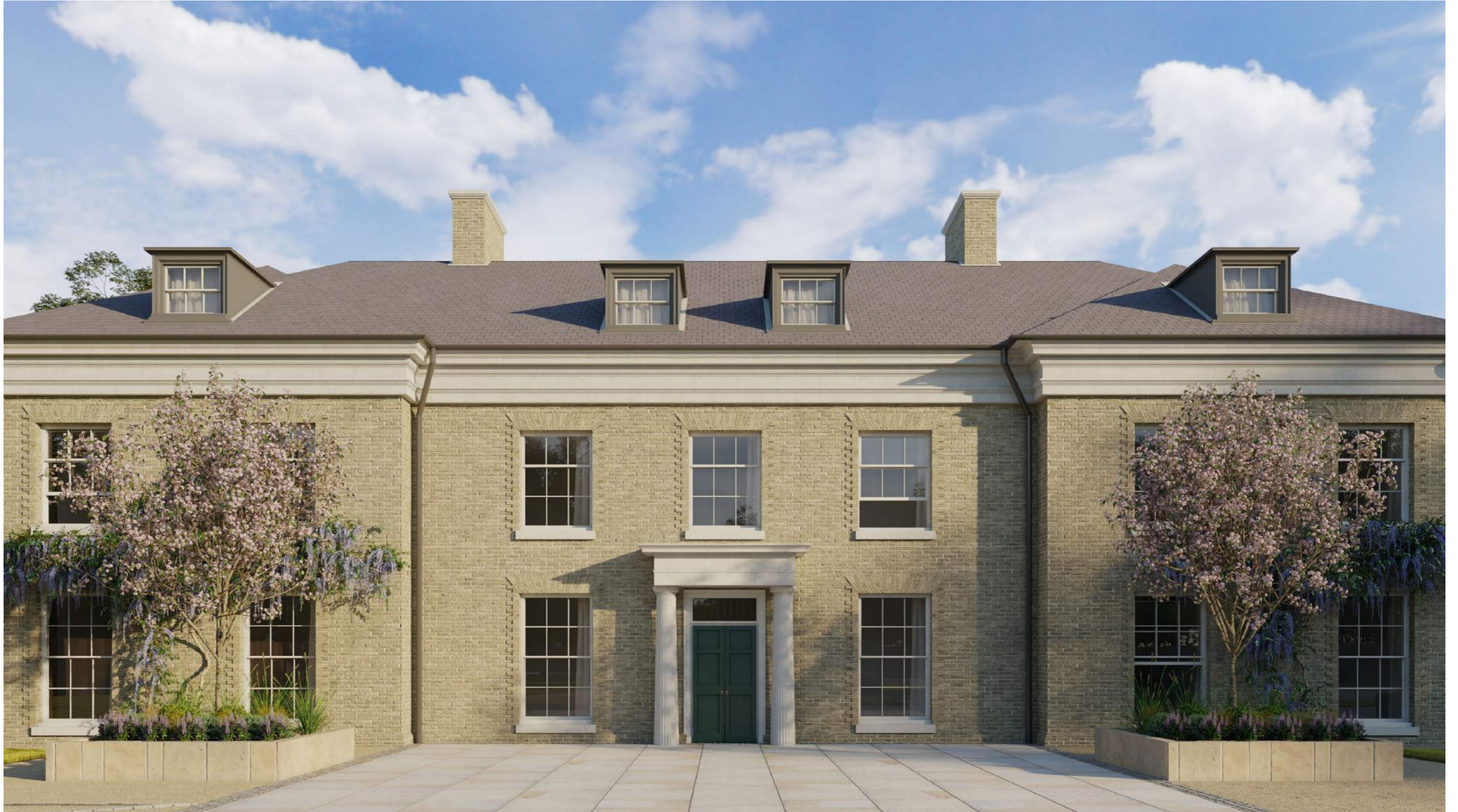
THE MAIN ENTRANCE