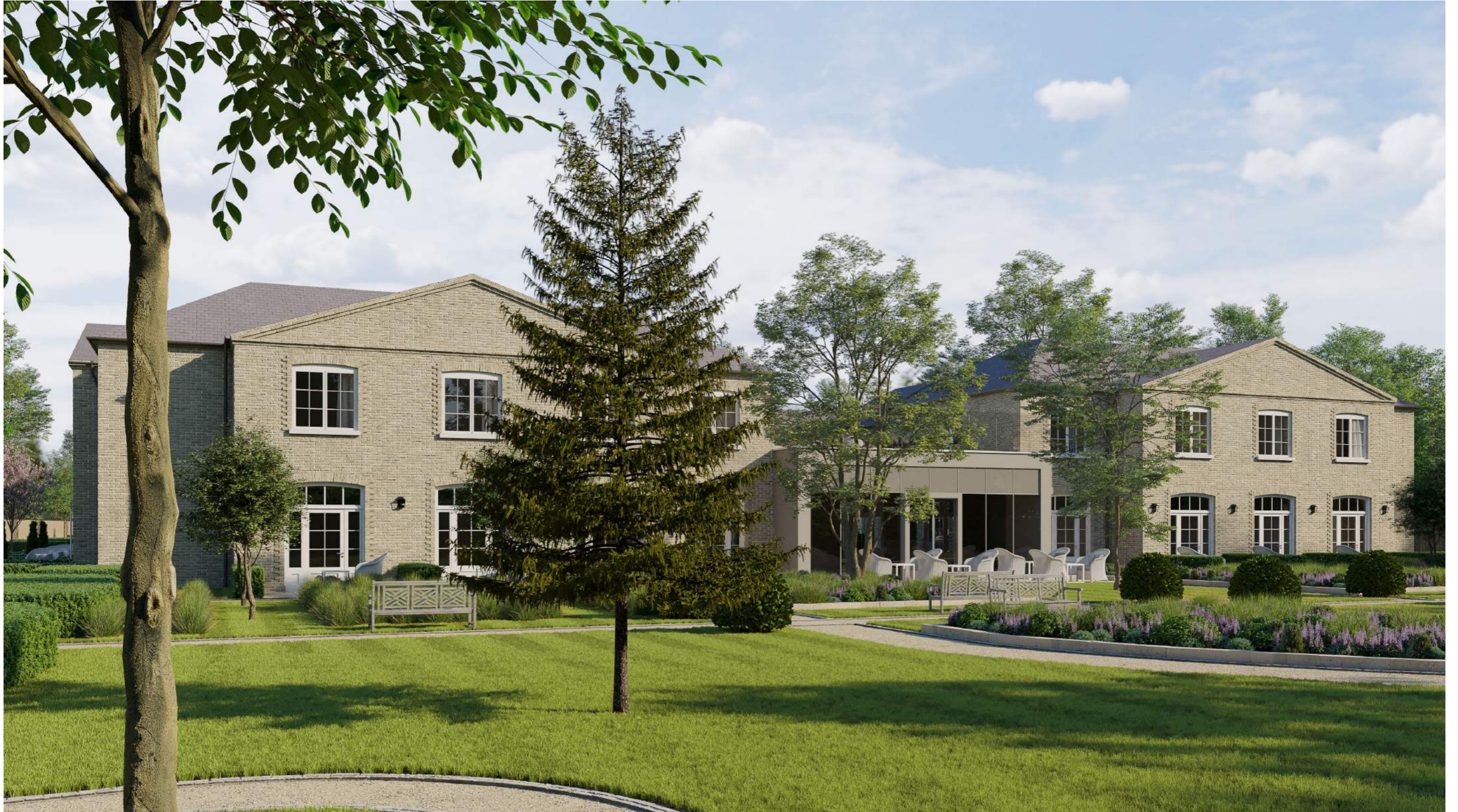
THE REAR GARDEN