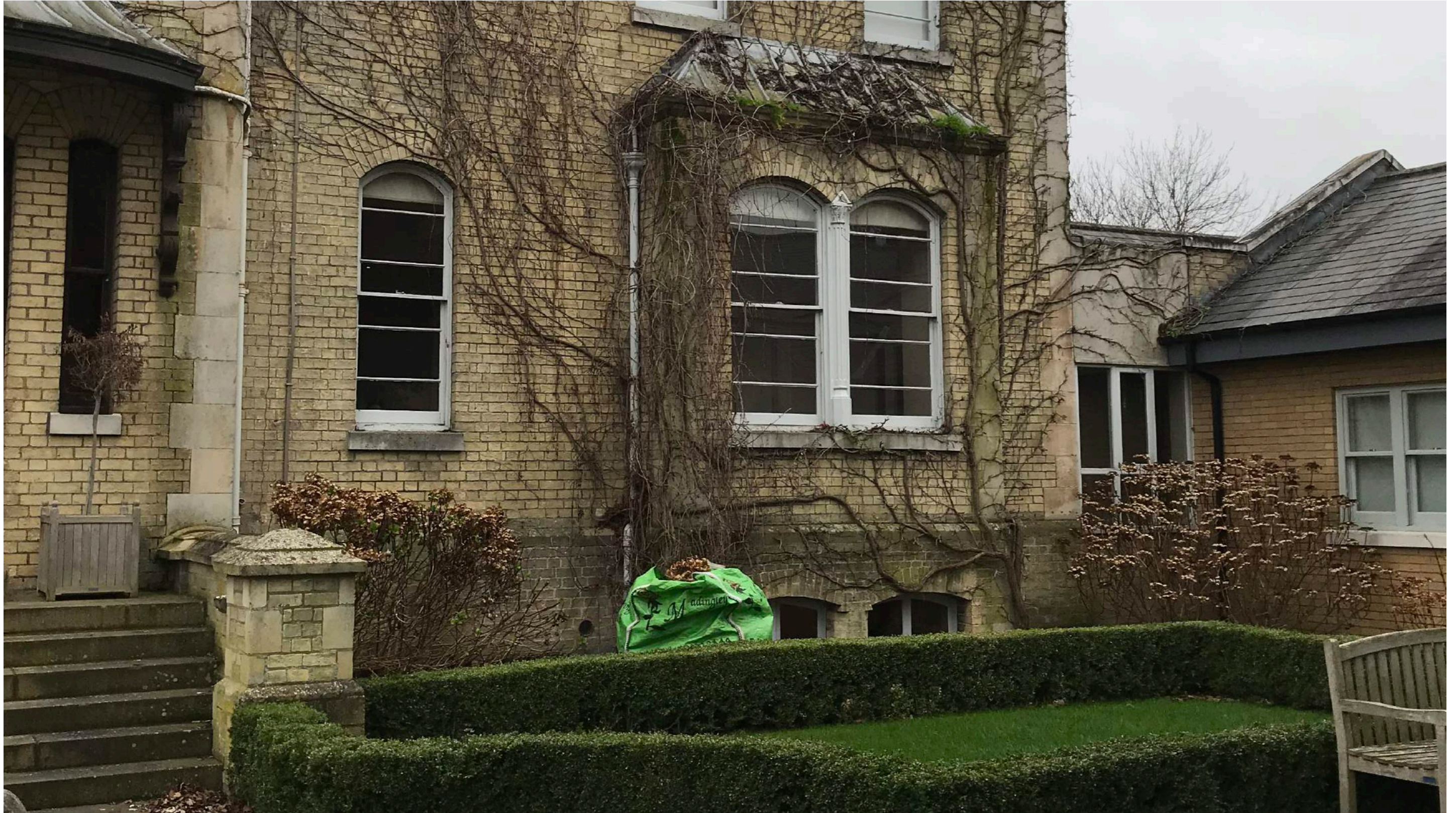
DIFFERENT STYLE AND DETAILING OF THE NEWER EXTENSIONS IN COMPARISON WITH THE ORIGINAL BUILDING