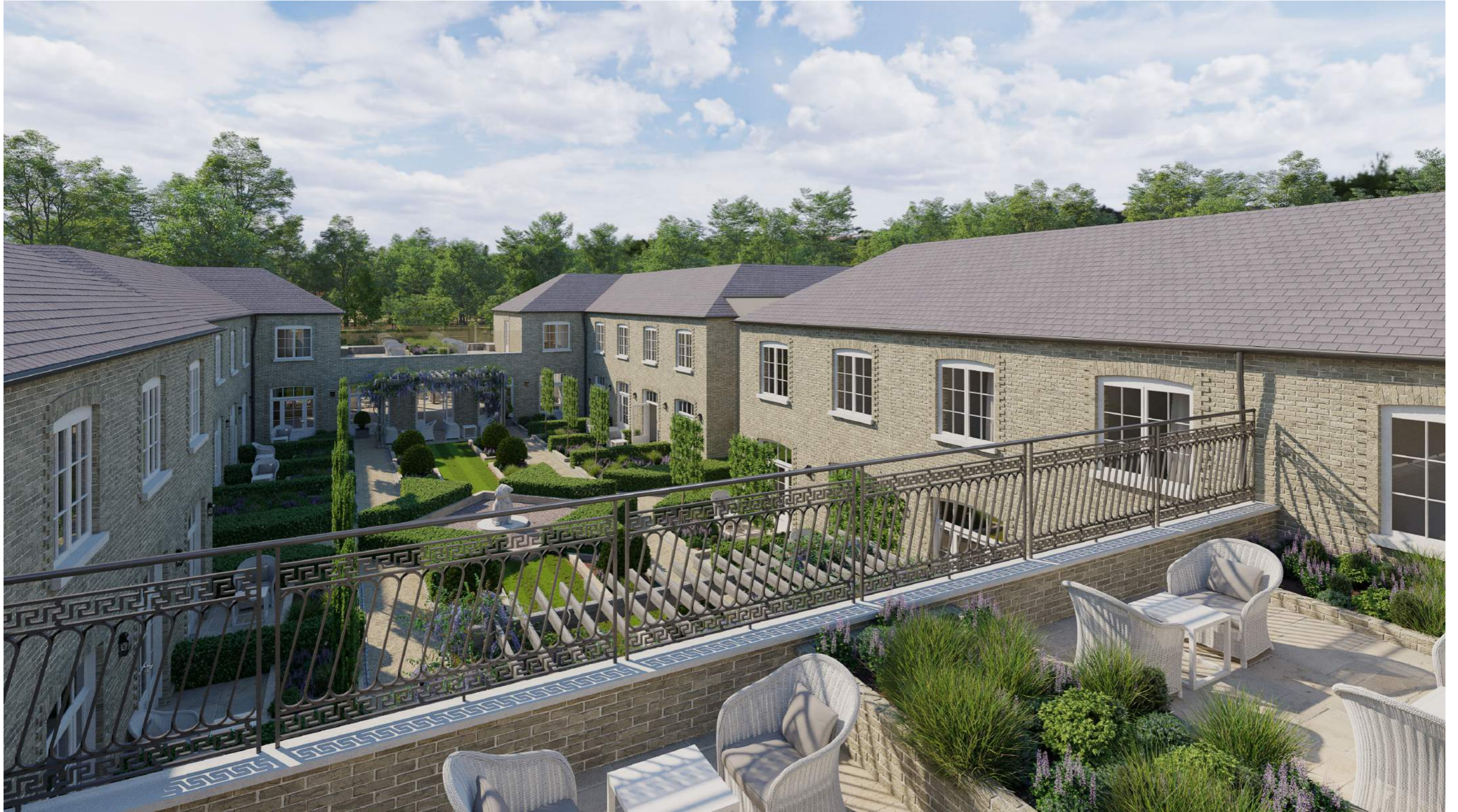
THE UPPER LEVEL TERRACE