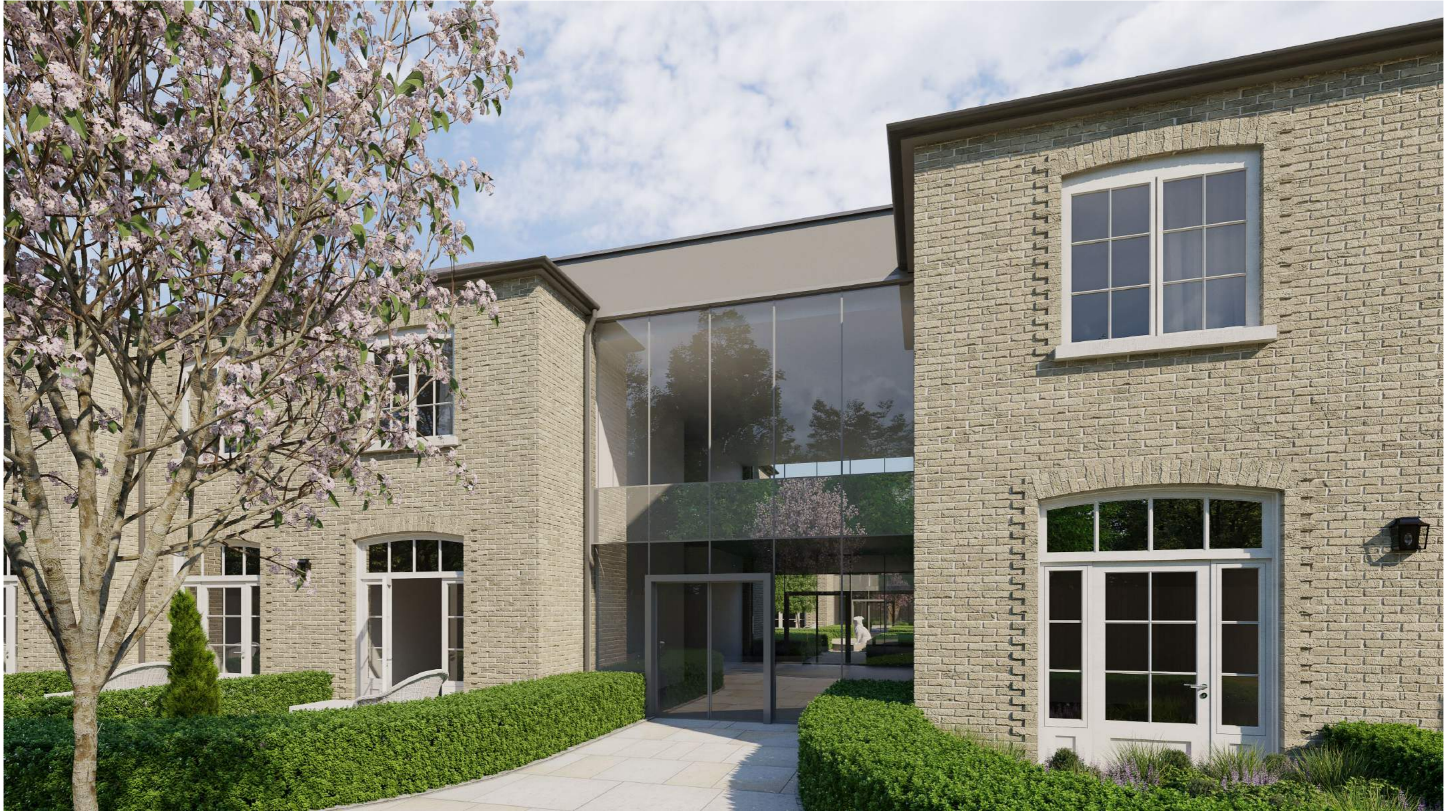
THE GLAZED LINK