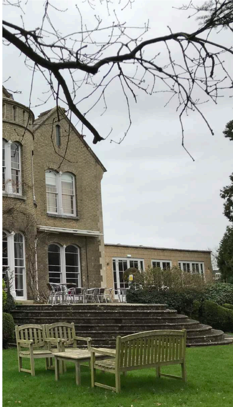
STEPPED ACCESS TO THE GARDEN FROM COMMUNAL ROOMS WOULD REQUIRE EXTENSIVE RAMPS TO OVERCOME LEVEL DIFFERENCE