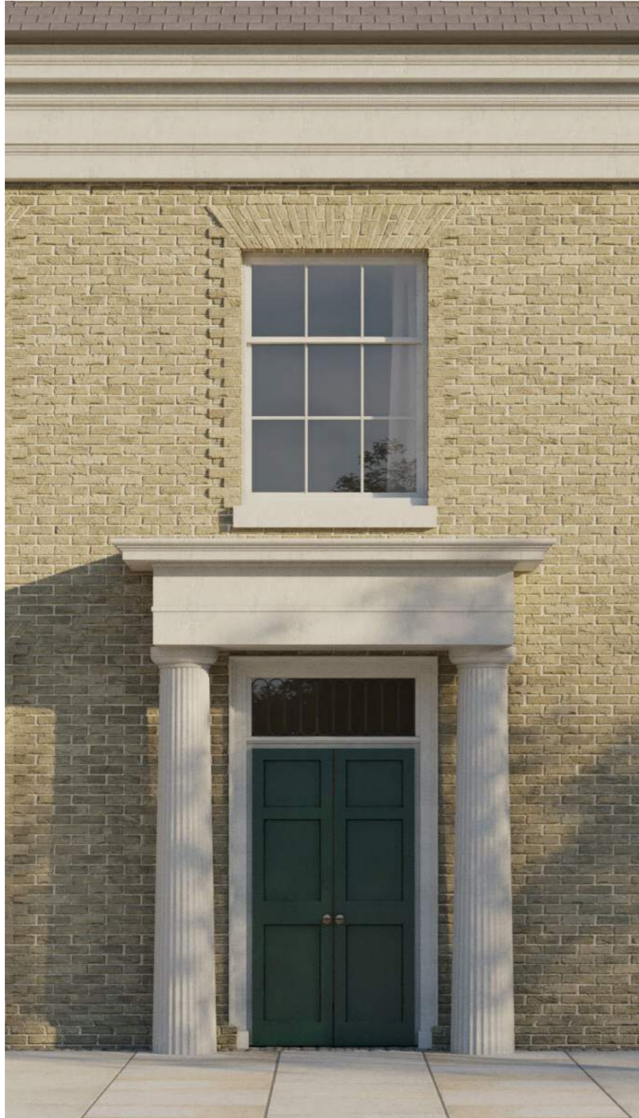
THE FRONT DOOR