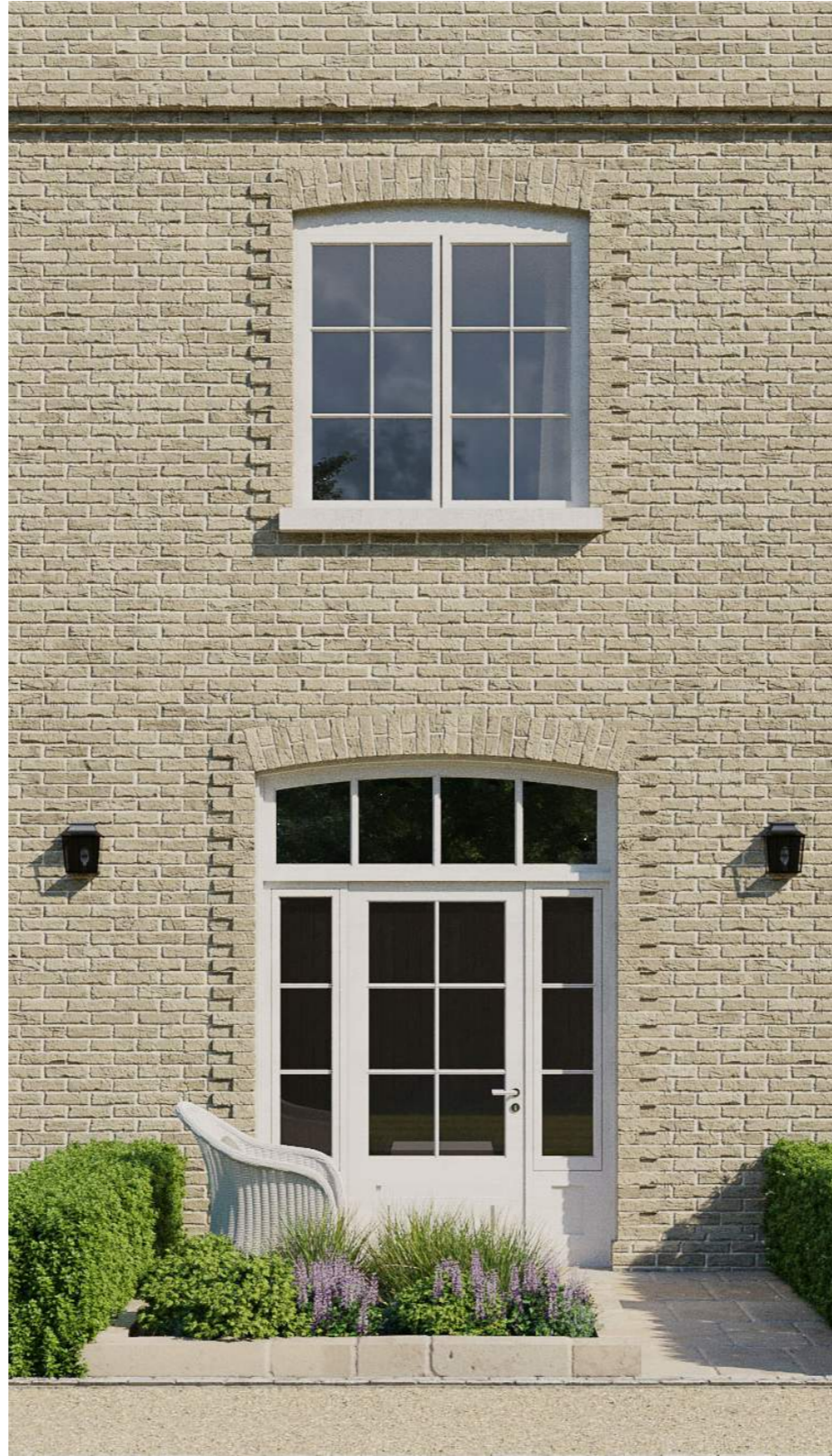
DOOR AND WINDOW DETAILING