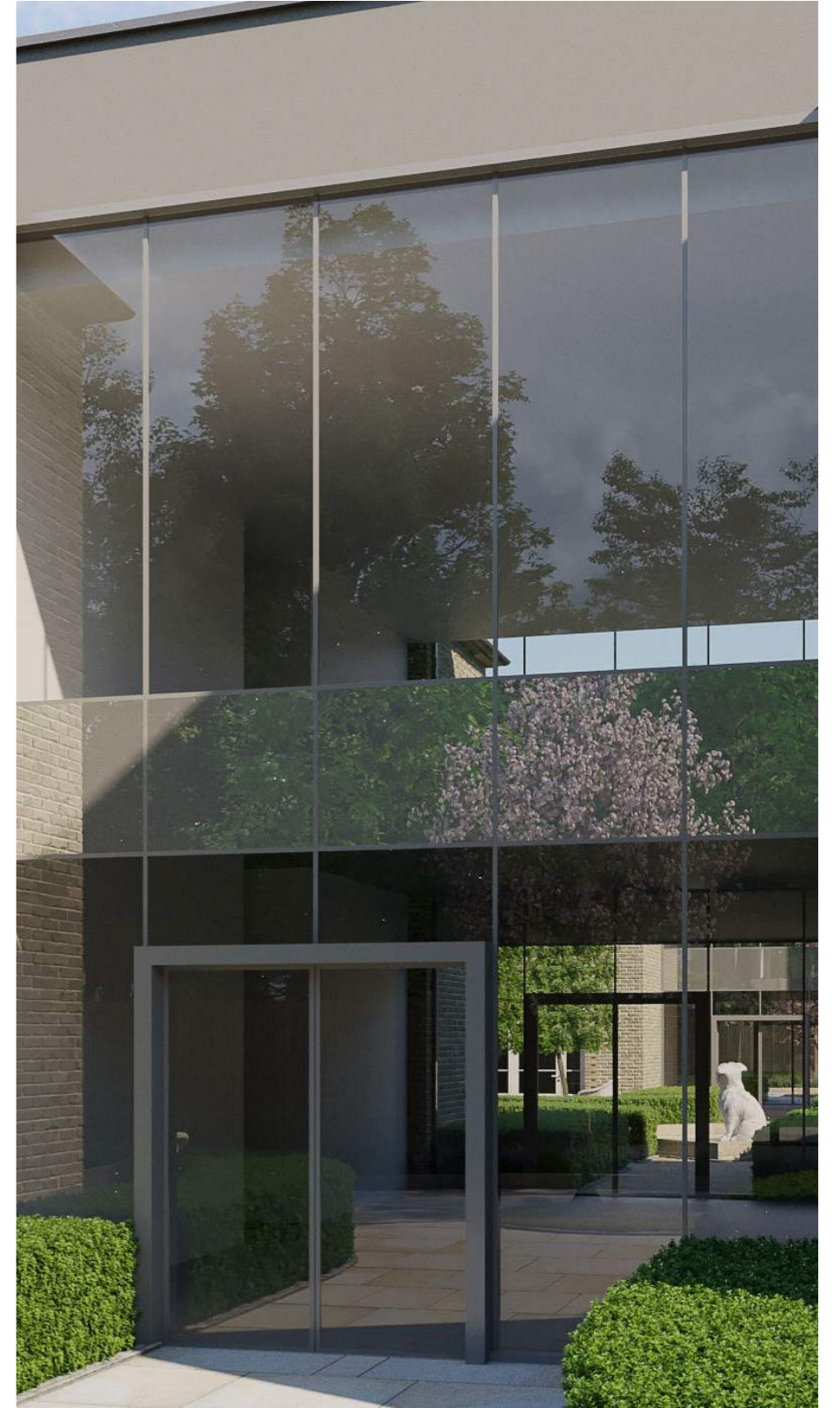
THE GLAZED LINK