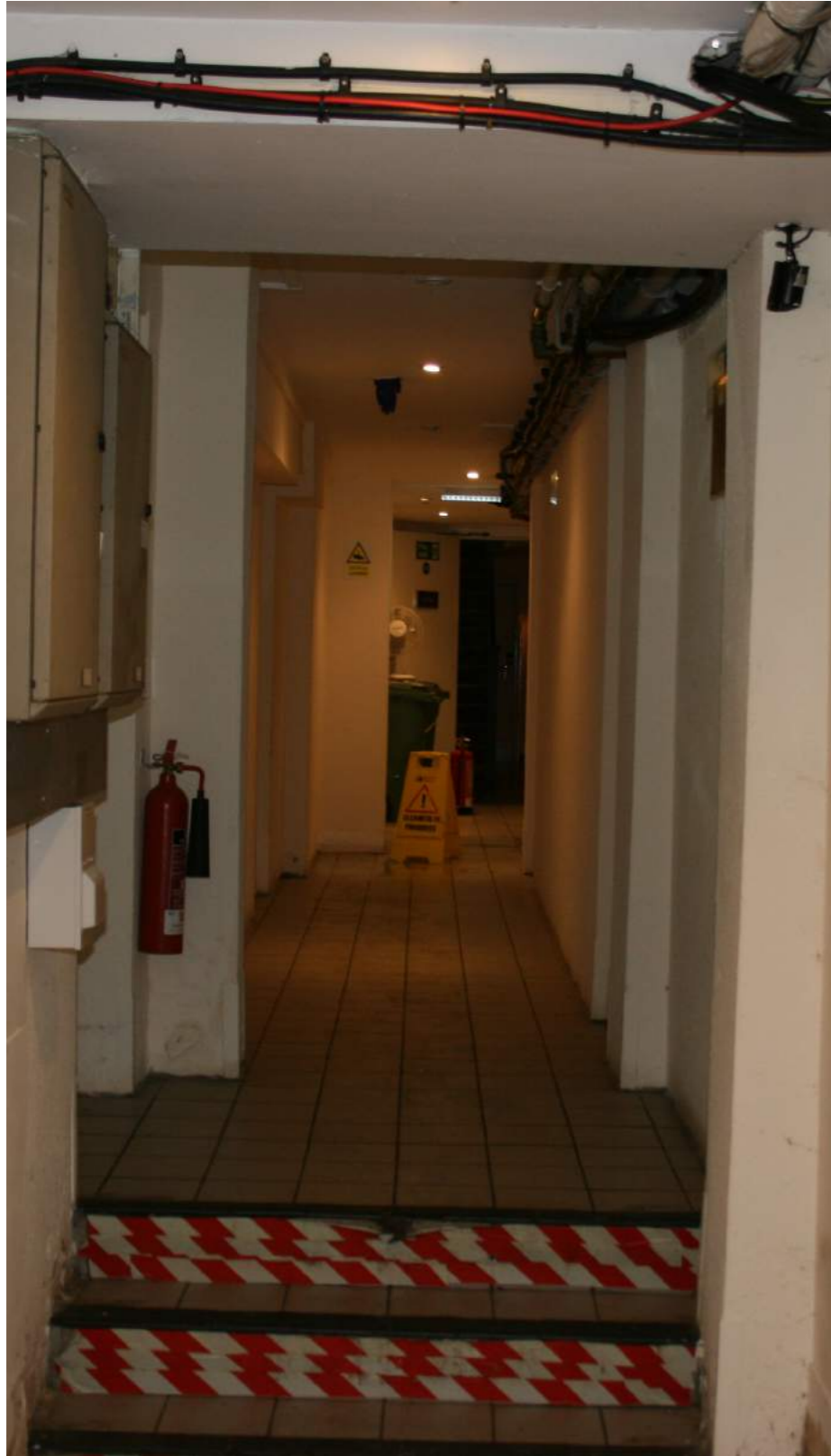
STEPS AS PART OF THE CORRIDORS