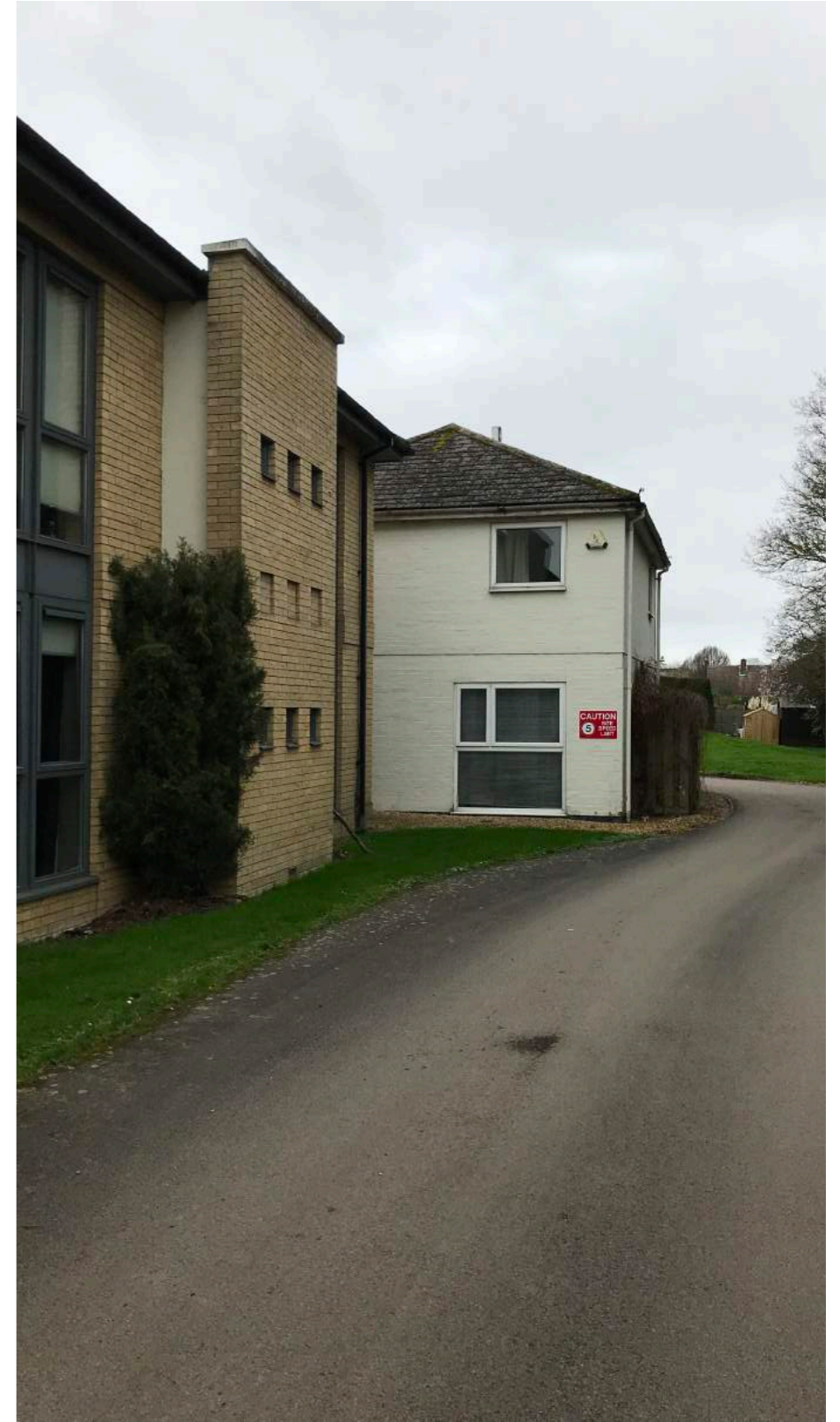
MEANDERING ROUTE THROUGH THE SETTING, LACK OF CONNECTIVITY INSIDE-OUT