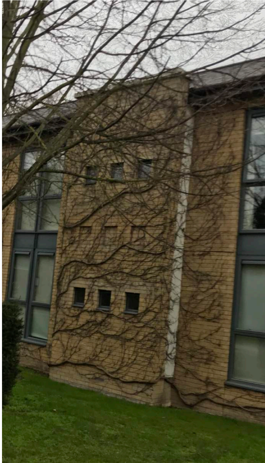
LEVEL ACCESS TO GARDEN FROM BEDROOMS UNFEASIBLE WHICH MEANS RESIDENTS WOULD NOT BE ABLE TO ACCESS EXTERNAL SPACES INDEPENDENTLY