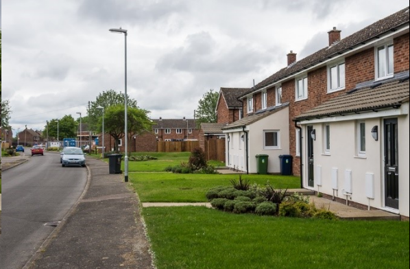
Capper Road, Waterbeach

South Cambridgeshire District Council was unable to demonstrate a Five Year Housing Land Supply for a period of time until the new Local Plan was adopted in 2018. This resulted in a number of housing schemes coming forward on green field sites between Waterbeach village and the former barracks. The Demographic & Socio-Economic Review identified four such schemes totalling about 250 dwellings that were granted permission between 2014 and 2016. Developers had also submitted new planning applications seeking to increase the housing densities on these sites so it is possible that they will deliver even more housing.