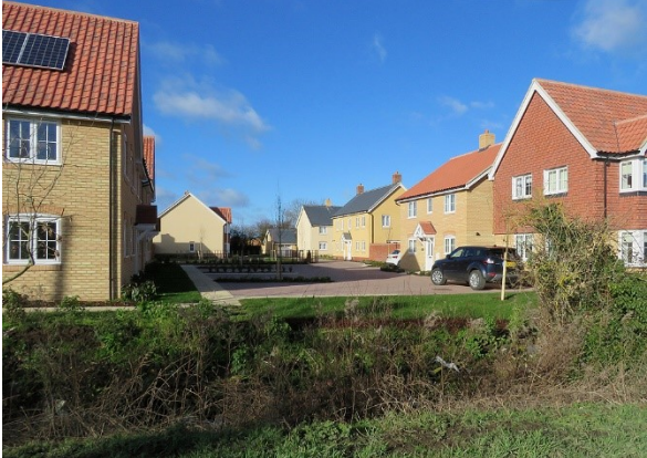
Harvey Way, Waterbeach