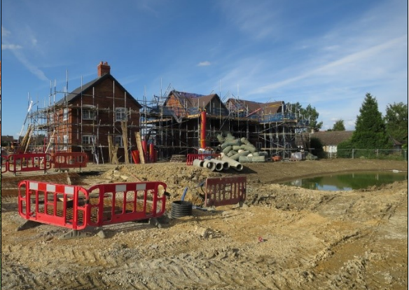
New housing under construction off Bannold Road, Waterbeach

Recent developments appear to have had limited effect on local house prices. Prices in Waterbeach ward are higher than in South Cambridgeshire for all sizes of properties bar the largest.