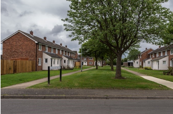
Cammell Walk, Waterbeach

Examples of former barracks accommodation which has been sold off and is now in owner occupation or the private rented sector