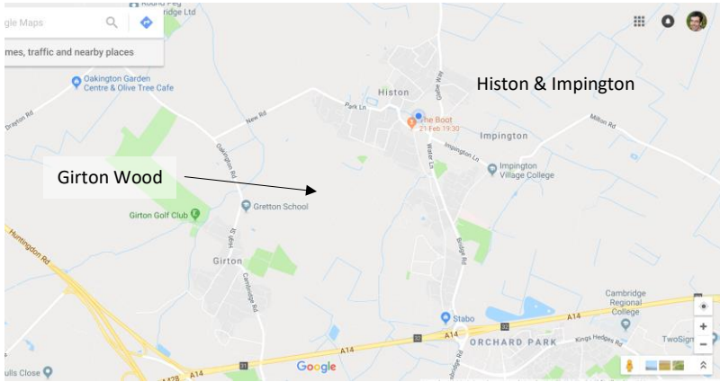
Figure 1. Location of Girton Wood, to the South West of Histon and Impington