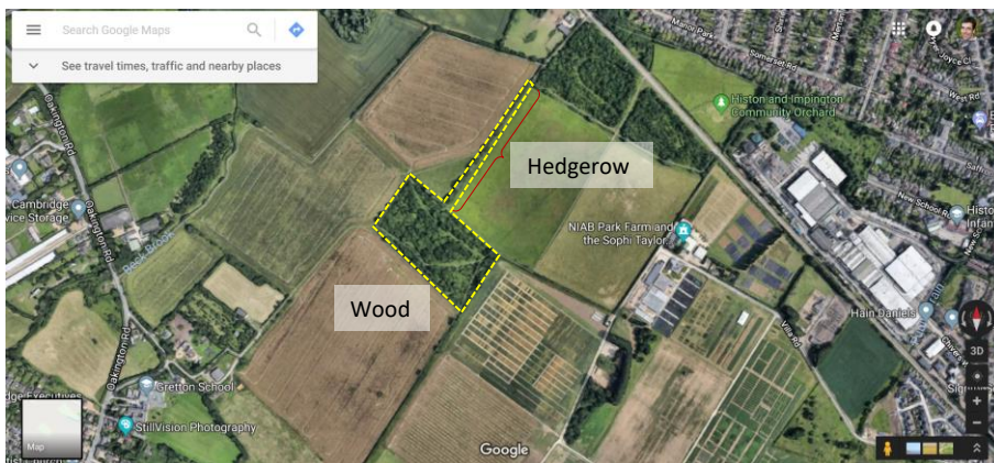
Figure 2. Google maps satellite view showing Girton Wood together with the hedgerow (including ditch and adjacent scrub) running to the north east from the Wood.