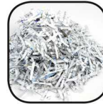
Shredded paper (in envelope or clear sack)