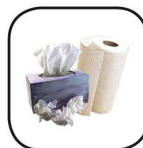
Used paper tissues and kitchen paper