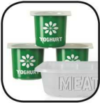
Plastic pots, tubs, trays & bags