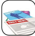
Paper & magazines