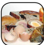
Cooked/uncooked food waste (including meat, fish and dairy)