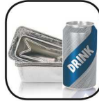
Tins, cans & foil