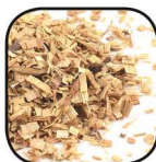
Untreated wood and sawdust