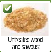
Untreated wood and sawdust