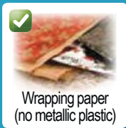
Wrapping paper (no metallic plastic)