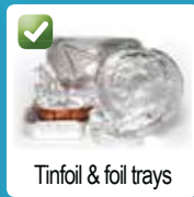
Tinfoil & foil trays