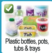
Plastic bottles, pots, tubs & trays