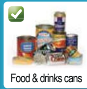
Food & drinks cans