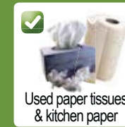
Used paper tissues & kitchen paper

Available from our Cambourne offices - use them in the kitchen and empty into the green bin when full. The caddy is free, paper liners cost £3 for 50.