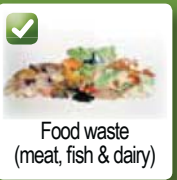
Food waste (meat, fish & dairy)