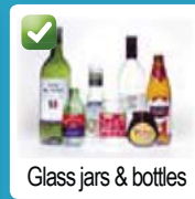
Glass jars & bottles