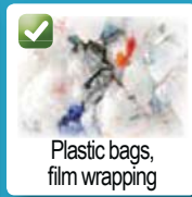
Plastic bags, film wrapping