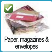
Paper, magazines & envelopes