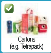
Cartons (e.g. Tetrapack)