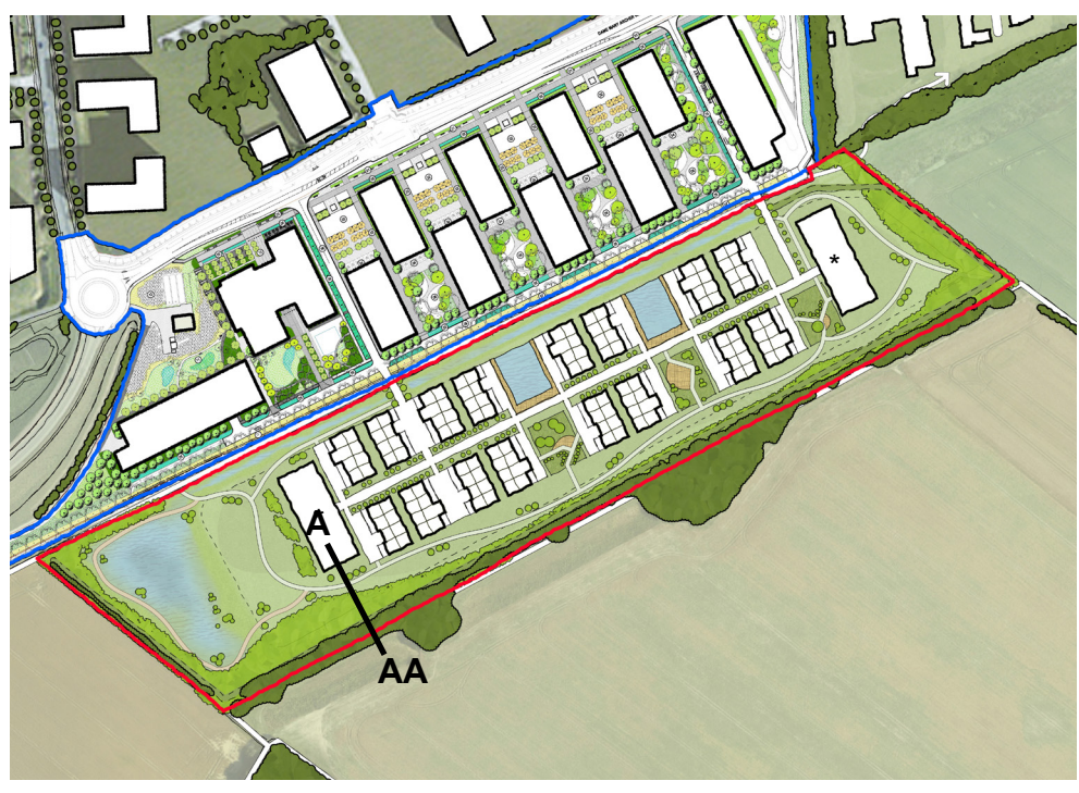
Section Location Plan (NTS)