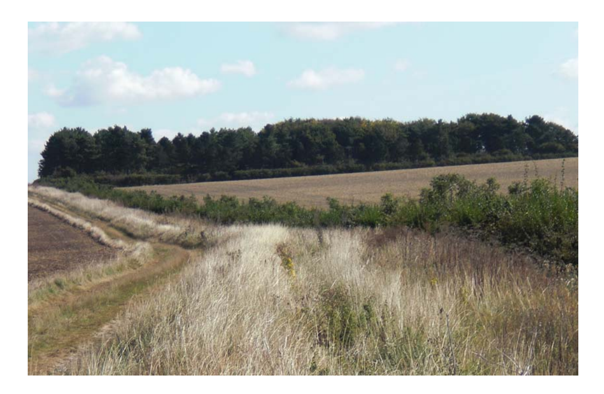
Rolling Chalkland Landscape near Balsham – The hedge line is recently established and connects two county wildlife sites.