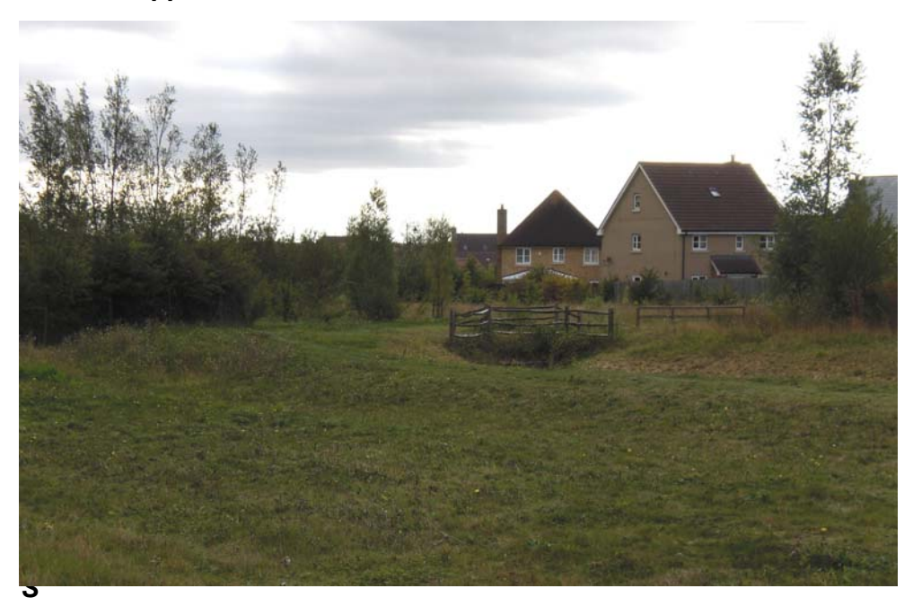
SUDS at Cambourne – Areas for water storage incorporated into public open space