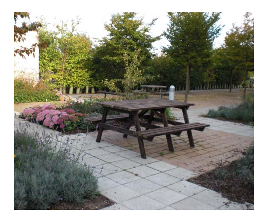
Small scale amenity spaces can offer a more human scale and the enclosure provided can reduce the impact of large buildings. The use of a mix of shrubs, trees and herbaceous plants can help to establish a more informal character.