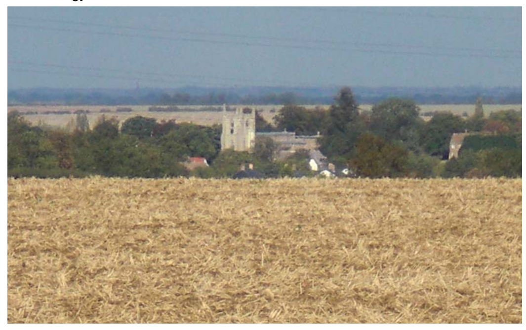
Near Elsworth - shallow valleys in the Clayland landscape

Medieval earthworks including deserted villages the major feature of visible archaeology.