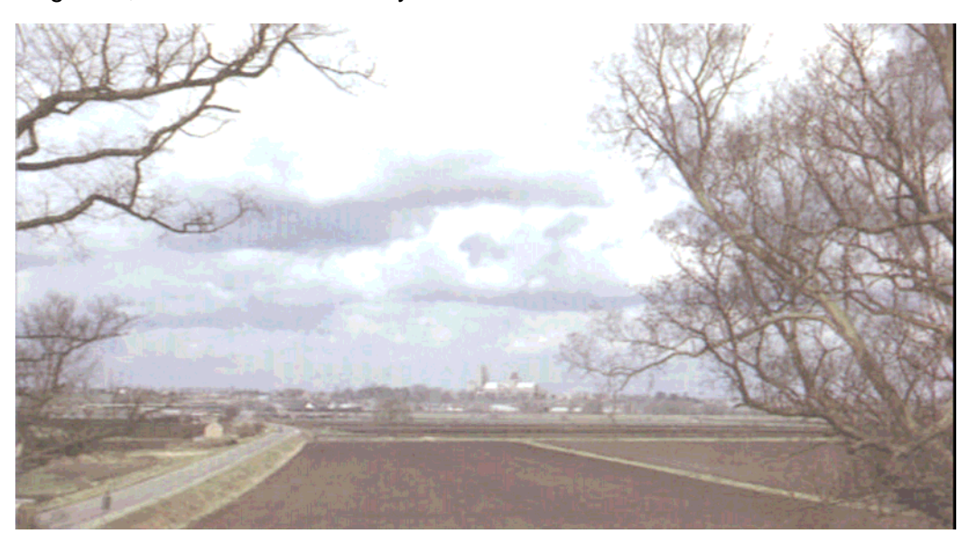
The Huge Sky of the Fenland Landscape - Looking towards the Isle of Ely and Ely Cathedral.

Typical tress and hedgerows include Ash, Oak, Poplar, Willow species, Hawthorn, Dogwood, Horse chestnut and Sycamore.