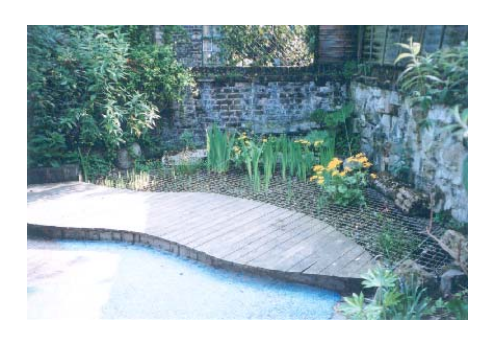
Above: A Safe Pond A pond with timber viewing deck and safety grid. This can be removed for 'pond dipping.'

Left: Imaginative space Timber, stone and changes in level combine to offer opportunities for imaginative play in a limited area.