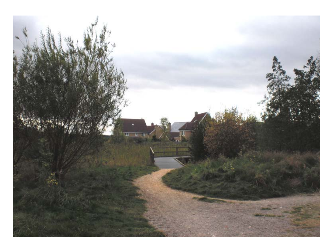
Large scale open space adjacent to housing development – Use of native planting and informal hard surfacing connects the development with existing landscape and on to the wider countryside.